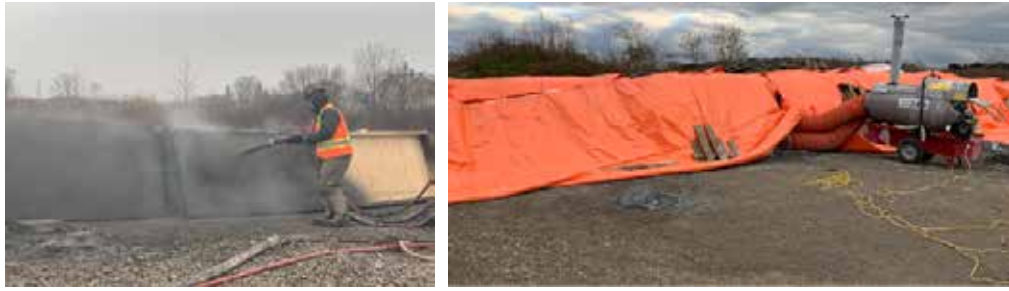
Spraying the panels and outdoor curing

loss during curing that is often observed with conventional silicate accelerators (Elsayed, Soliman, El Naggar 2023).