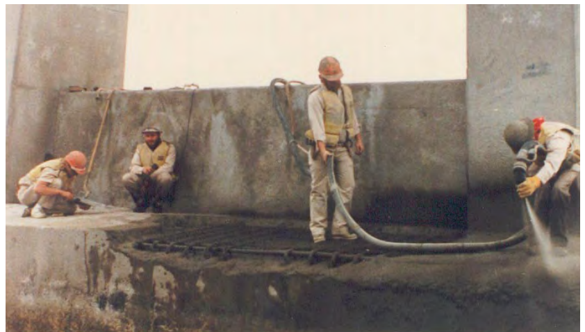
Figure 1: 1987, Herbert C. Bonner Bridge, Oregon Inlet, NC, Pile Cap Rehabilitation

2023 marks Coastal Gunite Construction Company's 40th anniversary, and ASA salutes your commitment to the industry!