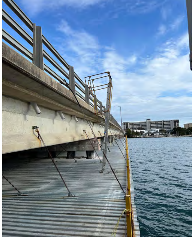
Figure 6: 2023, Scaffolding at Banks Channel Bridge, Wrightsville Beach, NC

a Level II ASA Qualified Shotcrete Contractor in the Dry-Mix process.