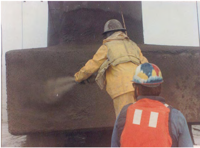
Figure 3: 1987, Herbert C. Bonner Bridge, Oregon Inlet, NC, Shooting Pile Cap