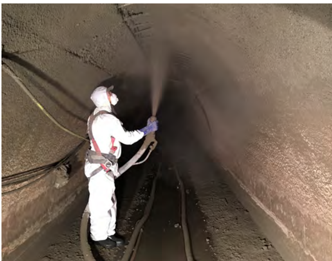
Figure 2: 2017, Washington, DC, Elliptical Sewer Rehabilitation

By specializing solely in shotcrete construction services, Coastal Gunite has developed a team of well-trained, highly experienced tradesmen. Coastal Gunite has more than 125 years of shotcrete experience among their site superintendents and over a dozen trained and ACI-certified shotcrete nozzlemen. Each Coastal Gunite site superintendent has a minimum of 25 years of shotcrete construction experience.