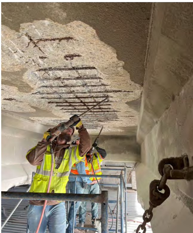
Figure 5: 2023, Chipping at Banks Channel Bridge, Wrightsville Beach, NC