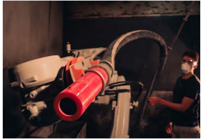
Robotic arm with shotcrete nozzle in the lab

Finally, the increasing complexity of shapes and optimally designed structures in architecture is pushing manufacturing methods to improve their technology. This project hopes to highlight the advantages of automated shotcrete, especially when compared to conventional 3D-concrete printing techniques. Indeed, shotcrete has tremendous advantages as it allows the use of conventional reinforcement with proven concrete design and facilitates the production of double-curvature elements. Moreover, shotcrete is a method particularly well adapted for high-performance concrete materials.