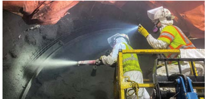
DC Water Adit construction, Washington, DC