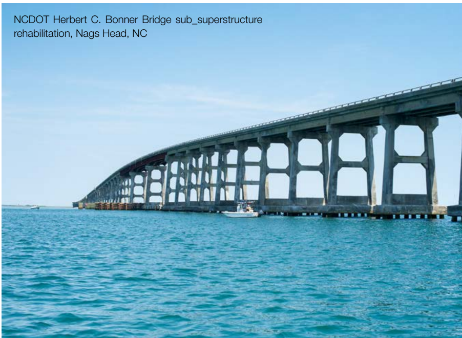
NCDOT Herbert C. Bonner Bridge sub_superstructure rehabilitation, Nags Head, NC