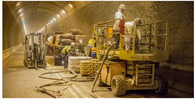
PennDOT Liberty Tunnel wall rehabilitation, Pittsburgh, PA

Today, Coastal Gunite provides services from offices located in Maryland, North Carolina, Tennessee, and Florida. For additional information please visit our website www.coastalgunite.com .