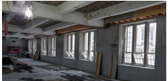
U.S. Military Academy at West Point shear wall installation