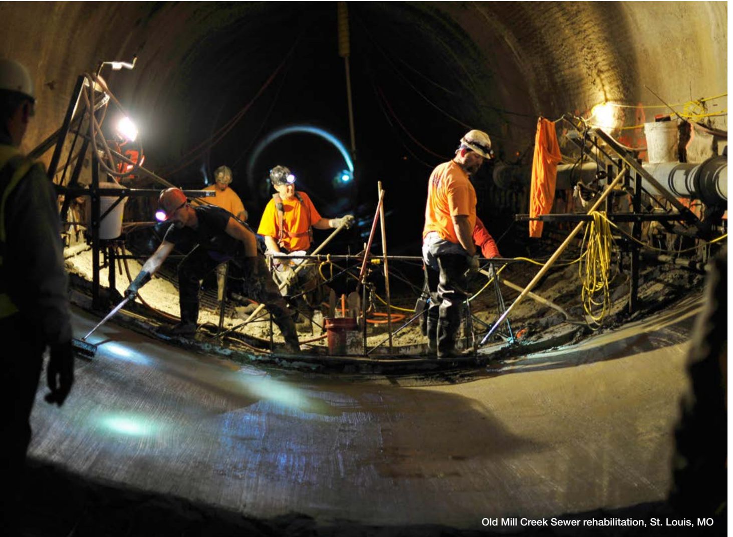
Old Mill Creek Sewer rehabilitation, St. Louis, MO

C oastal Gunite Construction Company has provided structural shotcrete services in the commercial, industrial, energy, and public markets for over 35 years. Since 1983, Coastal Gunite Construction Company has held an unwavering commitment to providing owners and engineers with technically capable and competent commercial shotcrete construction services.