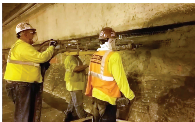
Nozzleman innovation for fireline encapsulation, 5-feet off the ground, at the Queens Midtown Tunnel. (2019 Outstanding Shotcrete Award)