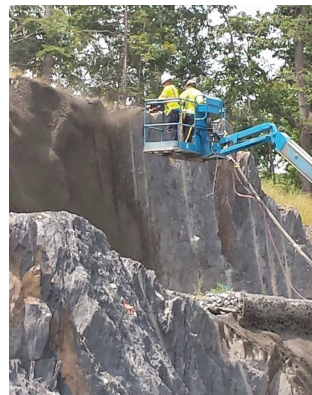
Newburgh Water Tunnel Bypass Project; a rock stabilization job. The production line for 5000 PSI wet-mix ran up to 60' above the ground, holding back the earth for the new access road for an aqueduct tunnel providing potable water to the residents of New York City.