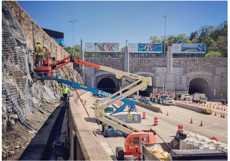
Rock slope stabilization in New Jersey at the Lincoln Tunnel.