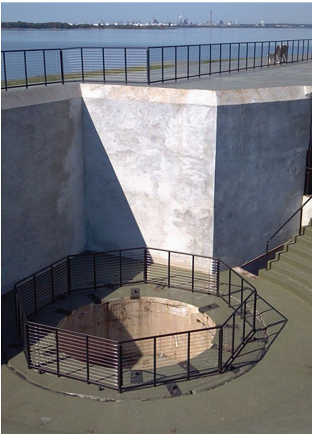
Historic rehabilitation of the battery walls and stairs at Fort Mott State Park, utilizing a mix design to match the existing composition and texture. (2012 Outstanding Shotcrete Award, Honorable Mention)