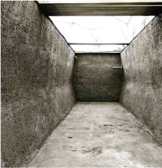
Wet-mix shotcrete lining for tank of an on-site wastewater treatment plant, 10" thick - It's all about perspective.