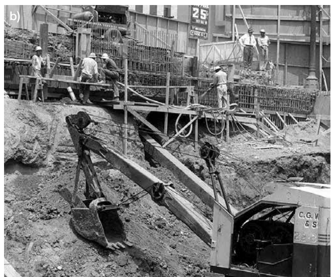
Shotcrete has been widely used for over a century; (a) a crew poses with their equipment in the 1920s; and (b) a crew places a foundation wall in the 1940s