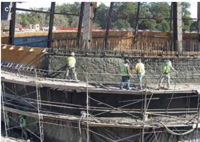
Shotcrete is ideal for placing complex structures: (a) the curved enclosure wall of Stanford University's Bing Concert Hall comprises shotcrete with a sand float finish; (b) a certified nozzle operator and a blowpipe operator construct mockup panels for the enclosure wall; and (c) crews placed the 12 in. (300 mm) thick enclosure wall in multiple lifts, using a removable screed rail to control the thickness