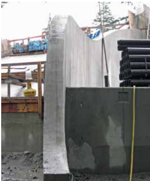
Fig. 7: Curved and oscillating up and down, structural and architectural sandblasted concrete structure for VanDusen Botanical Gardens

ASA's 2012 Outstanding Shotcrete Project of the Year Award for Architecture adds credibility to the shotcrete industry as an established and recognized process for building our cities and infrastructure. "Shotcrete is Concrete."