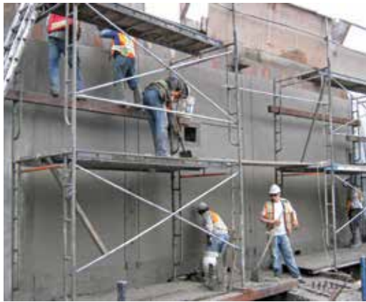
Fig. 6: Applying the steel trowel finish on the walls and detailing in the vertical architectural reveals