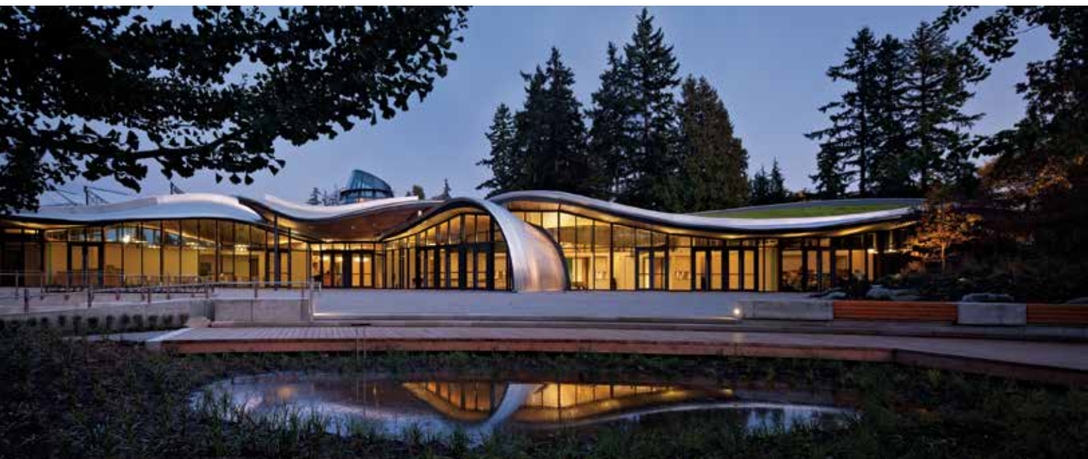
Fig. 1: VanDusen Botanical Gardens

The management team from Ledor Construction, in conjunction with Whitewater Concrete, approached our management team for some alternative solutions using structural shotcrete