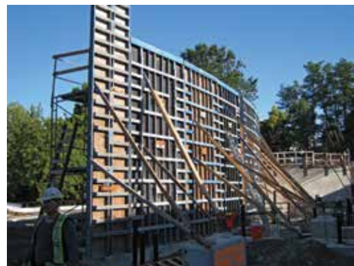
Fig. 4: Torrent custom shotcrete panels