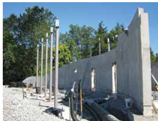
Fig. 3: Completed feature wall prior to sandblasting. Exterior area view, post-shoot