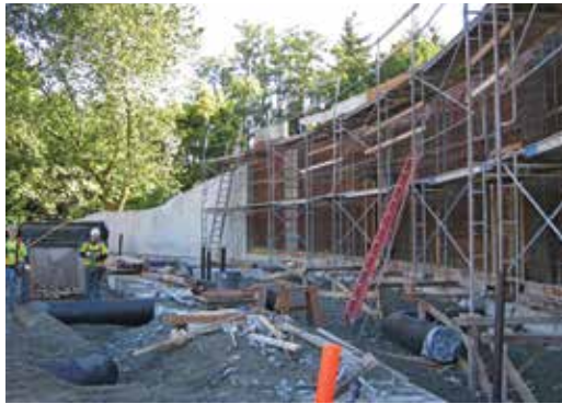
Fig. 5: Preparing one of the feature walls for shooting. Exterior area view prior to shoot

VanDusen Botanical Gardens is self-sufficient, carbon-neutral, and has LEED Platinum certification. It has won numerous other awards for its design and implementation. Winning