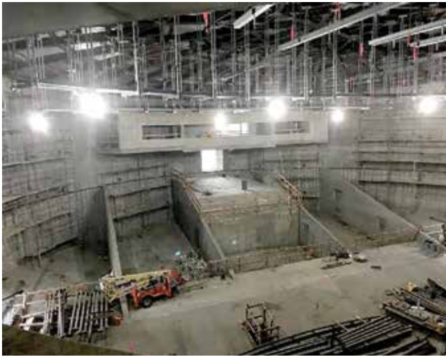
Fig. 2: Interior of David Geffen Theater