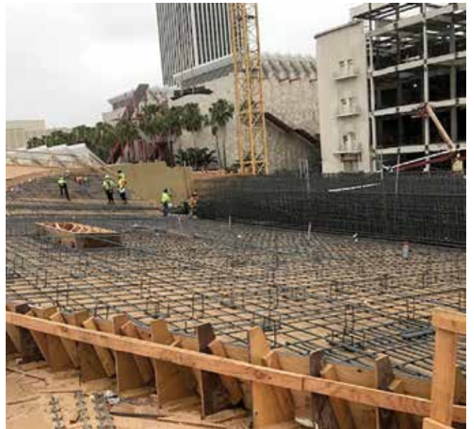
Fig. 5: Superior Gunitite preparing to shoot the wing slabs

plus front- and back-of-house walls at opposite sides of the theater.