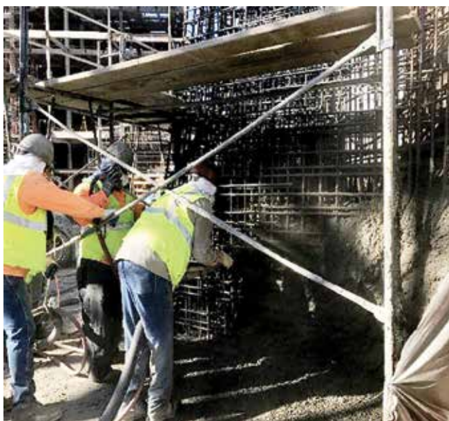
Fig. 1: Superior Gunite on site shooting the mockup

This structure was created using precast panels to form its unique shape. From the interior of the structure, Superior Gunite shot 24 in. (610 mm) thick, full-height, three-dimensional complex-curve shear walls, rising to 50 ft (15 m) in height—all of this while adhering to the strict tolerances required for the distinctive curved walls. Also shot during the construction sequence were structural support walls