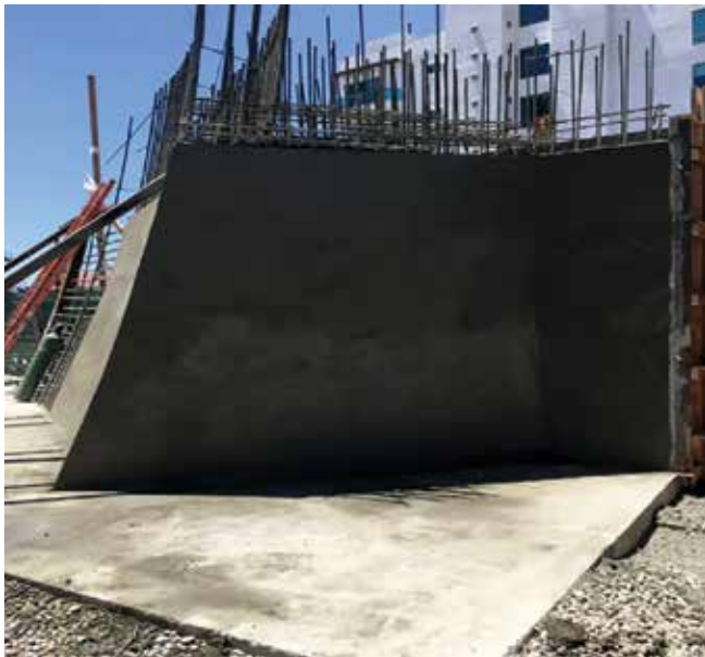
Fig. 4: Trapezoidal columns shot by Superior Gunitite