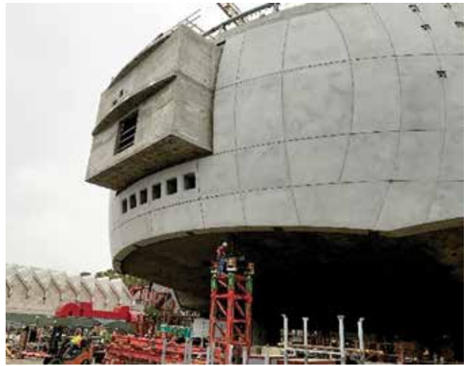
Fig. 3: Exterior of David Geffen Theater