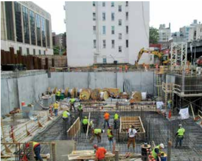
Fig. 1: Hudson Yards, 12,000 lb/in. 2 (83 MPa) foundation