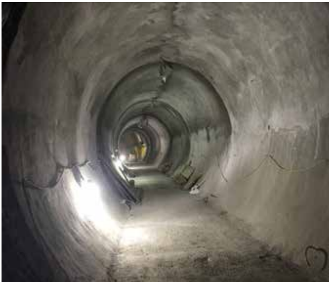
Fig. 2: East Side Access tunnel section