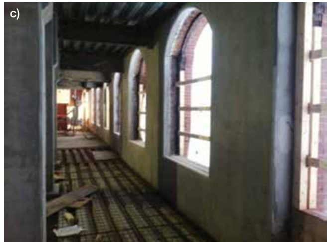
Fig. 5(a), (b), and (c): Seismic retrofit work around the United States, from tight spaces, to high-early strength, to irregular shapes