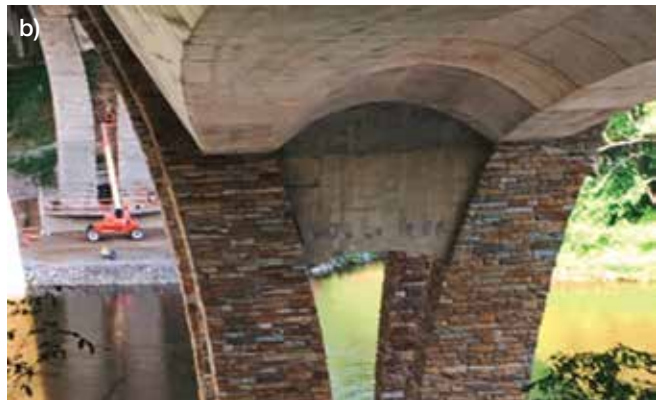
Fig. 3(a) and (b): Brattleboro Bridge, VT, shot and carved the flared architectural treatment 100 ft (30 m) off the ground