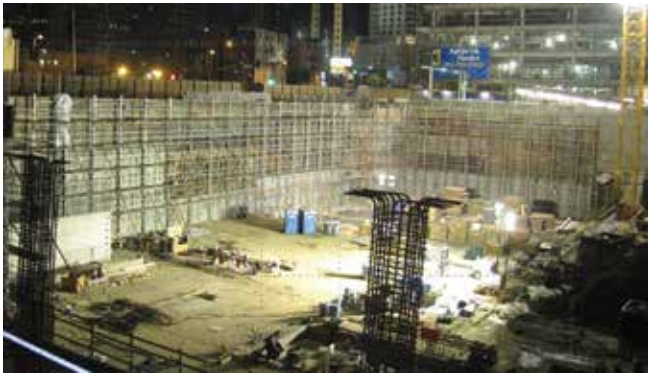
Fig. 4: Staples Center foundation walls

the acceptance of shotcrete as a cost-effective alternative to conventional form-and-pour methods in the structural concrete market. After proving the time and cost saving advantages on some of the largest civic and civil projects in Los Angeles and across California, Superior Gunite began to expand its geographic reach. Superior Gunite now serves the entire continental U.S., Hawaii, and locations abroad. One bridge, one tunnel, one building at a time, Superior Gunite and its talented team members have had the opportunity to prove the viability of the shotcrete alternative as it has helped build the vital infrastructure of the communities it serves.