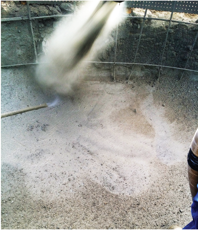
Fig. 5: Using an air lance is critical to maintaining a clean substrate during the shotcrete process. Without the air lance the substrate will develop a layer of overspray and rebound that will prevent bonding of the new material to the existing material