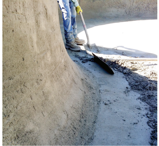
Fig. 9: A finished cove and wall shot in place on the second day of a shoot

and removing it from the pool. The air lance also removes excess water and can help to maintain a saturated surface dry (SSD) condition to receive the material. Laying down a nice bed of material for a long run of a joint will help the nozzleman build up the wall as if they were shooting against all new material on the floor. Constant attention is needed to achieve a good bond and an acceptable surface. Without an air lance this method is simply not possible.