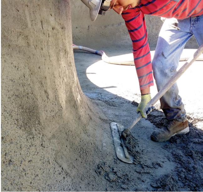
Fig. 8: Finishers remove the excess material from the cove to handcraft the shape and feather the cove down to the floor