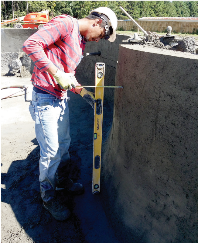
Fig. 7: Once the cove is shot in place, a level and tape are used to verify the dimensions of the wall