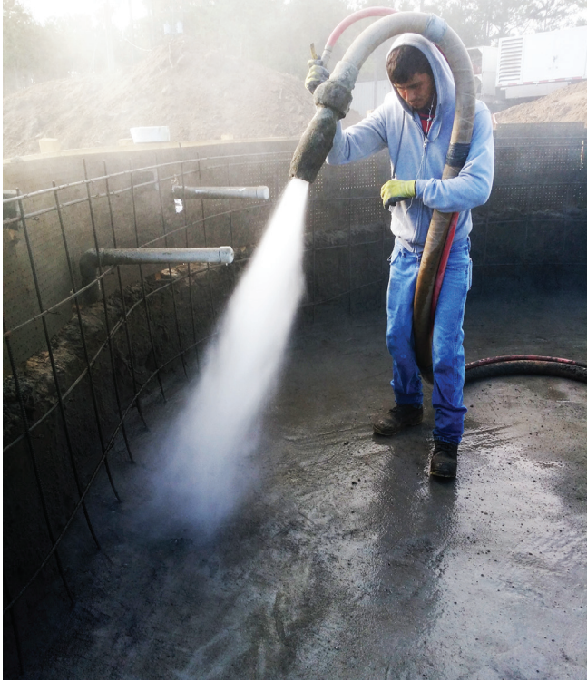
Fig. 4: Cleaning the surface area with high-pressure air and water. This process gets the substrate to a clean SSD state. This is essential to achieving a solid bond between the new and existing material