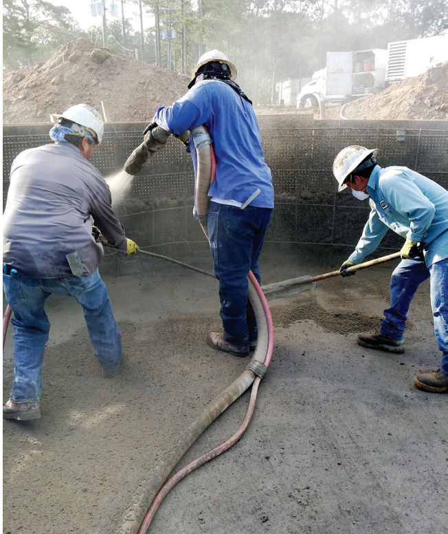
Fig. 6: Maintaining a clean substrate is a very active procedure. It helps to have a finisher using a Fresno to remove excessive rebound