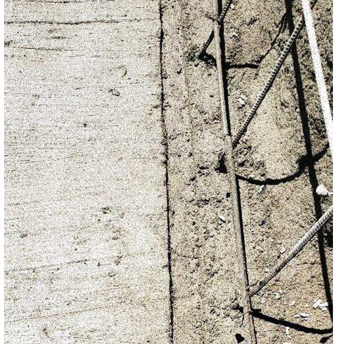
Fig. 3: This is the preferred method that a crew should be ready to install on 2-day projects when possible

Problems using a feathered edge may and are likely to arise if the most stringent care and attention to detail is not used. If rebound or trimmings are not removed and the nozzleman is not willing to stop and continually clean the surface while applying the edge, then poor quality concrete materials may get incorporated at the interface. This will likely be discovered during the plaster prep through high-pressure washing, acid washing, or hammer sounding the joint with a hammer. It is also possible that these same problems will