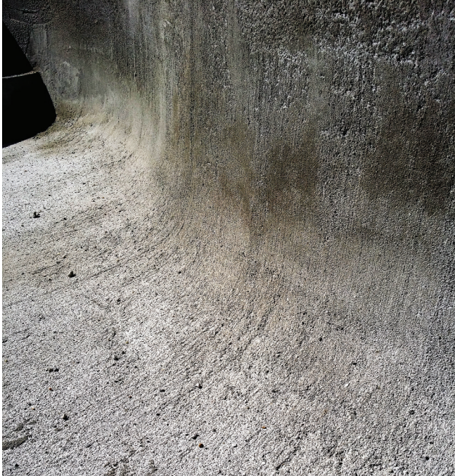
Fig. 2: In this application the procedure was done well enough that at 28 days, the connection point is hardly perceptible

During plaster prep, nuances or variations in shotcrete work are resolved by the plaster, tile, or stone prep crew; therefore, having a 1/4 in. broken edge generally falls within the acceptable finished tolerances of the shotcrete pool shell. The concrete shell is just that—it's a shell. The surface is going to be covered so a perfectly smooth surface is not necessary. A good, solid surface with no voids and a good bond between joints is necessary to create a watertight vessel that is structurally sound. You should strive to provide a final surface very close to the finished tolerances required by the pool builder to minimize prep by pool work that follows shotcreting.