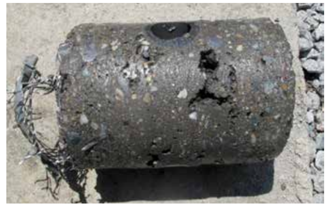
Fig. 13: Side view of Core No. 3. Note voids in front of cooling pipes. Assigned ACI Core Grade No. 3

Figure 13 shows a side view of Core No. 3. While shotcrete consolidation is generally good around the reinforcing steel and cooling pipes, there are some voids in front of the cooling pipes. This was considered marginally acceptable shotcrete.