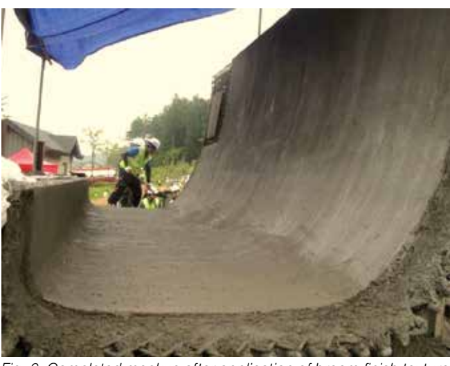
Fig. 6: Completed mockup after application of broom finish texture

Figure 6 shows the completed mockup after application of the broom texture finish. Figure 7 shows members of the mockup engineering design, inspection, and construction team.