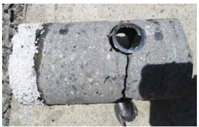
Fig. 16: Side view of Core No. 6 from invert. Shotcrete well consolidated and assigned ACI Core Grade No. 1

In summary, the shotcrete in Core No. 6 from the invert and Core No. 7 from the high wall cove is high quality. The shotcrete in Core No. 5 from high in the high wall is of unacceptable quality. Three of the four cores (Cores