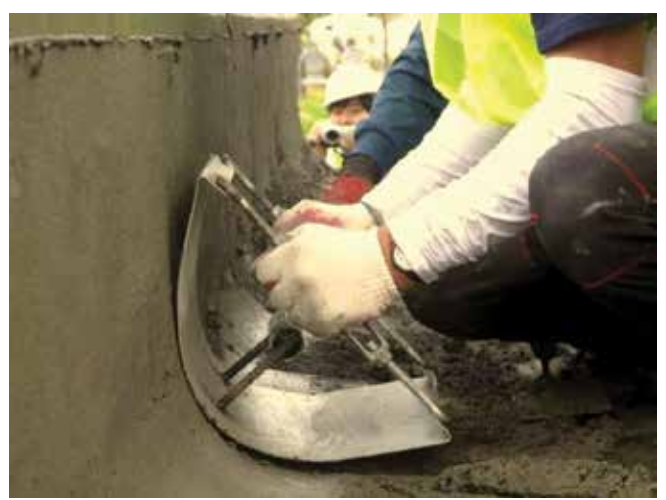
Fig. 5: Finishing radius cove of low wall with a custom-built tool