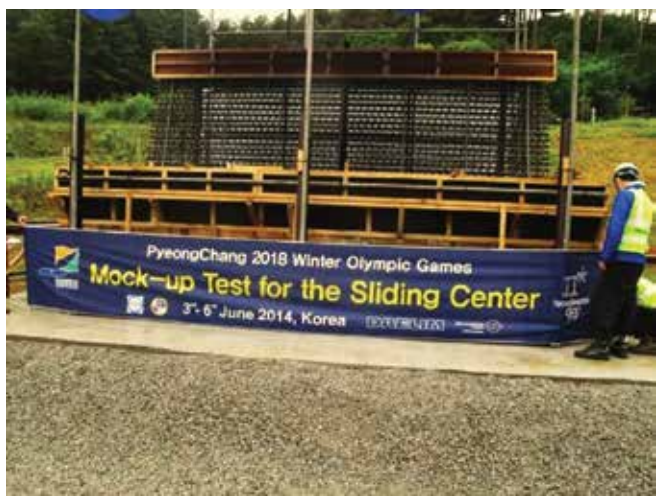
Fig. 1: General view of track mockup prior to shotcrete construction

Figure 1 shows a general view of the track mockup prior to shotcrete placement with the reinforcing steel and cooling pipes installed in the track. Also note the open edge forms used at the top of the lower wall section (low wall) and the plastic screed pipes used to control final finish line and grade. Figure 2 shows an end view of the cooling pipes and reinforcing steel in the higher wall section of the track (high wall). Also note the stay-in-place form installed at the back of the wall.