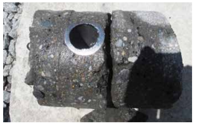
Fig. 17: Side view of core No. 7 from high wall cove. Shotcrete typically well consolidated and assigned ACI Core Grade No. 2