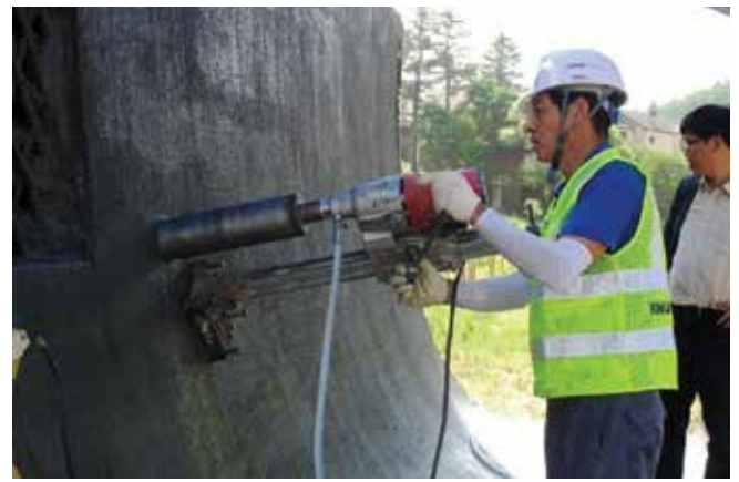
Fig. 8: Diamond drilling extraction of first core

Figure 11 shows Core No. 1. There is excellent consolidation of the shotcrete and encapsulation of the front layer of reinforcing steel and around the cooling pipe. The shotcrete is, however, porous and not well consolidated around the back layer of reinforcing steel (left side of the photo) adjacent to the stay-in-place