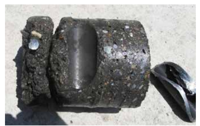
Fig. 15: Side view of Core No. 5. Core broke in two at porous zone behind cooling pipe. Assigned Core Grade No. 4