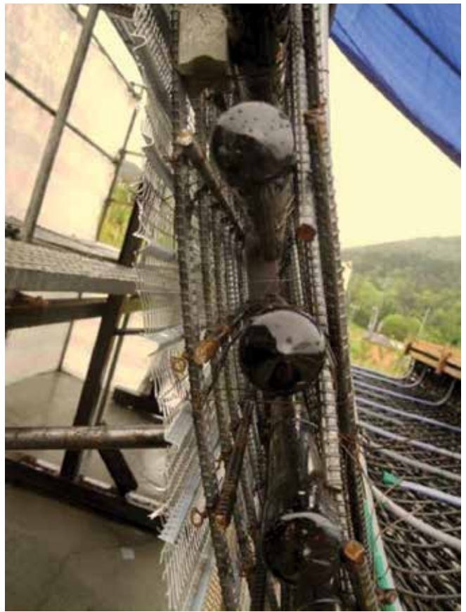
Fig. 2: End view of reinforcing steel, cooling pipes, and Stay-Form in high wall

The mockup was constructed in accordance with the project design drawings and specifications. The cooling pipes and reinforcing steel were installed as specified, except for one small area in the invert, where some of the reinforcing steel intruded into the "covercrete" zone of the mockup. The contractor acknowledged this item will be corrected during construction of the actual track. It was also noted that the stay-in-place form installed at the back of the structure had V-ribs that were only 0.3 in. (8 mm) high. As a result, the stay-in-place form will be chaired only 0.3 in. (8 mm) off the back row of vertical reinforcing steel. This is less than the 0.4 in. (10 mm) diameter of the vertical bars. While not a major concern for the "coved" areas of the track, where the shotcrete can be further consolidated by