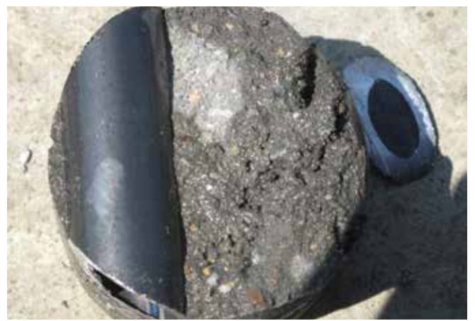
Fig. 12: View of middle of Core No. 2. Note porosity behind cooling pipe. Assigned ACI Core Grade No. 3