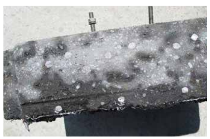
Fig. 10: View of top of slab removed from high wall. Note voids behind cooling pipe and back reinforcing bar

Figure 12 shows a side view of Core No. 2. This core broke in two during core extraction at a porous zone behind