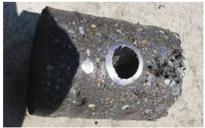
Fig. 14: Side view of Core No. 4. Note porous shadow behind cooling pipe. Assigned ACI Core Grade No. 3

Figure 14 shows a side view of Core No. 4. The shotcrete in front of and around the cooling pipe is well consolidated. There is, however, a porous "shadow" behind the cooling pipe and, overall, this core would be considered marginally acceptable.