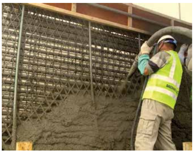
Fig. 4: Shotcrete applied to the coved area of the high wall