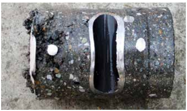
Fig. 11: Side view of Core No. 1. Note voids around back layer of reinforcing bar near stay-in-place form. Assigned ACI Core Grading No. 4