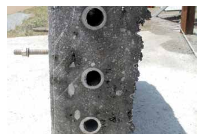
Fig. 9: View of right side of slab removed from high wall. Note typically good encapsulation of reinforcing bar and cooling pipes

form. This shotcrete was considered unacceptable. The likely reasons for the shotcrete around the back layer of reinforcing steel and adjacent to the stay-in-place form being porous have been discussed previously in this article in the section discussing shotcrete application.