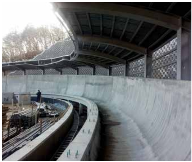
Fig. 18: Sliding track under construction

close to being of suitable quality. It is believed that, with implementation of the "opportunities for improvement" referred to in this report, and with the increasing skills that will be developed by the nozzleman and crew as the final track construction proceeds, the owner should receive a quality track that conforms to the intent of the project specifications.