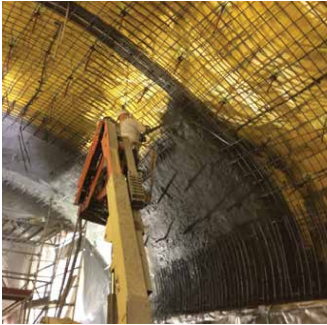
Shotcrete application building up from wall