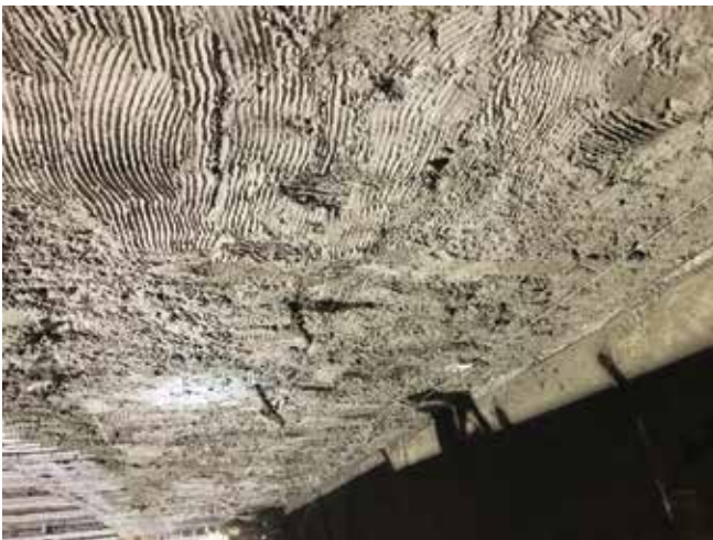
Scratch finish between layers