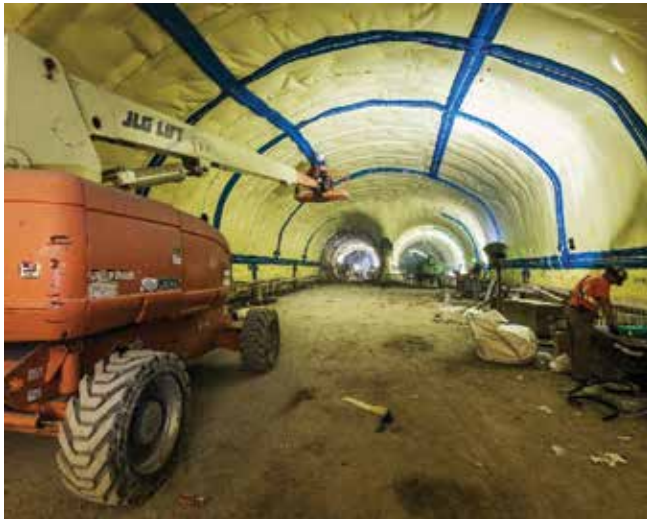
PVC membrane waterproofing system

The overhead shotcrete application against the PVC waterproofing membrane is undertaken on scaffold or lifts