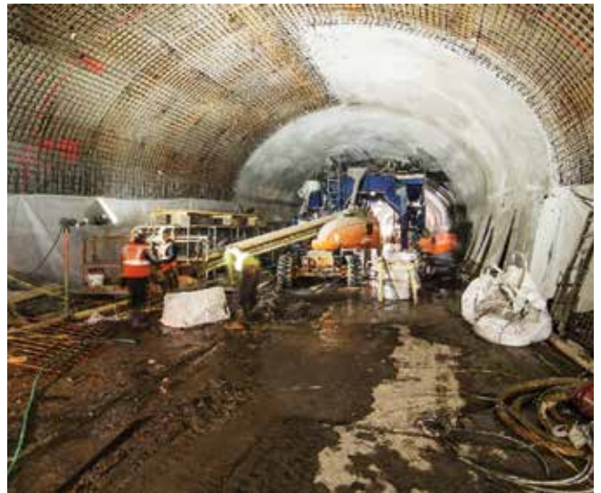
Second-layer reinforcement mat

to provide proper access for the nozzle to ensure it is within effective range for good encapsulation. With the nozzle pointed perpendicular to the receiving surface, and rotating to assure you get slightly different angles within 3.2 ft (1 m) of the back surface. The concrete material is applied in thin layers building up from the more vertical section of the walls to the overhead arch. Doing so minimizes the rebound as you approach the overhead sections. As you build up the concrete, focus is placed on building around the rock bolts to act as a bridge to support the load of the final lining. Reinforcing steel is encased by a combination of the workability of the material, distance of the nozzle, and high impact velocity, causing the concrete to flow around the bar, creating full encasement of the reinforcing bar and compaction of the concrete.