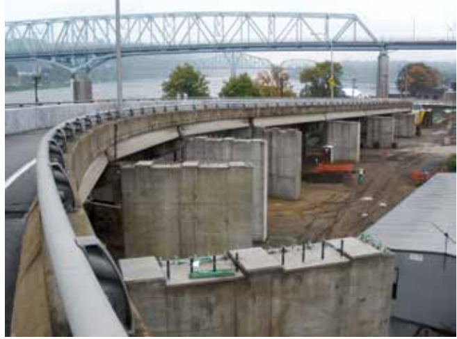
Repairs have been completed and the piers are ready for installation of the superstructure and deck in Rochester, PA

This project involved the rehabilitation of a PENNDOT-owned 700 ft (210 m) long precast concrete I-beam ramp bridge carrying New York Avenue over Norfolk-Southern Railroad tracks and Harrison Street in Rochester, PA. The work included the rehabilitation of existing reinforced concrete piers using Quikrete Shotcrete MS with fibers, dry-process shotcrete placement, and incorporated cathodic protection (anodes) in the concrete repair patches. Vector Galvashield<sup>®</sup> anodes were encapsulated in non-shrink grout and shotcrete