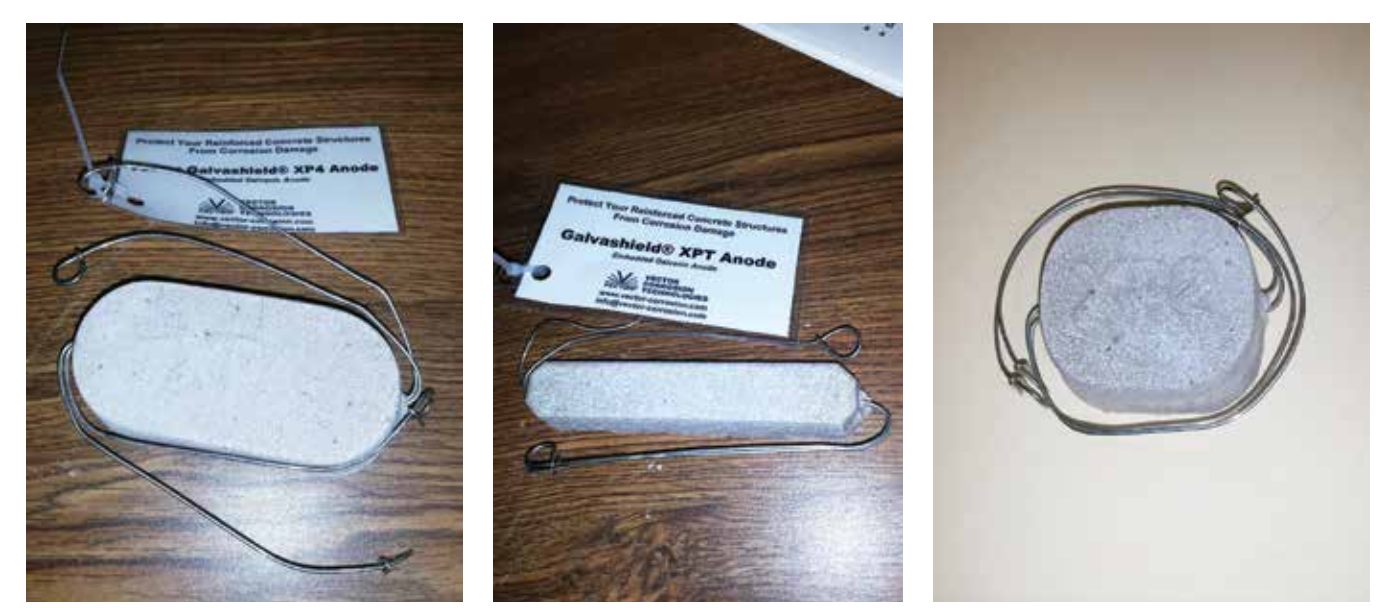
Cathodic protection is now offered in various shapes and sizes, some of which are more conducive to shotcrete application

Several techniques have been developed to overcome these conductivity issues, thus allowing the two systems to work together. First, it was determined that encapsulating the anode in a less dense, more conductive material, such as non-shrink grout prior to application of the shotcrete would minimize the adverse effects the shotcrete has on the anode. Non-shrink grout is used to "pancake" the anode, surrounding it with a material that does not interfere with the anode's ability to work correctly. Another technique developed was to redesign the anode shape so that it could