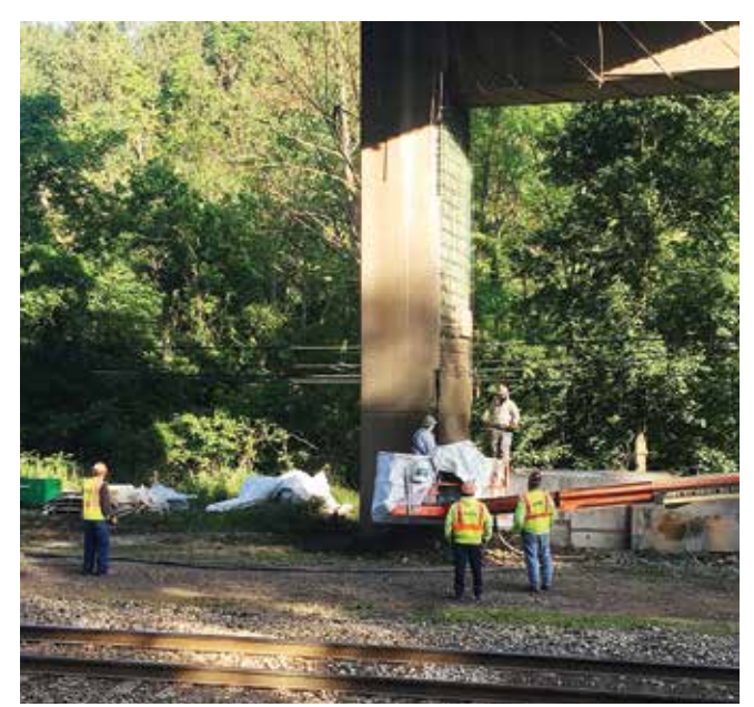
Material being cut and finished to match the original shape and profile of the pier

In summary, with modern approaches, we can use shotcrete and cathodic protection together. Cathodic protection is a method of corrosion protection that is rapidly gaining popularity. At the same time, the shotcrete method is also experiencing rapid growth in popularity both in new construction and as a concrete repair method. Because of this parallel growth, opportunities to use the two systems together have increased and new, innovative techniques are