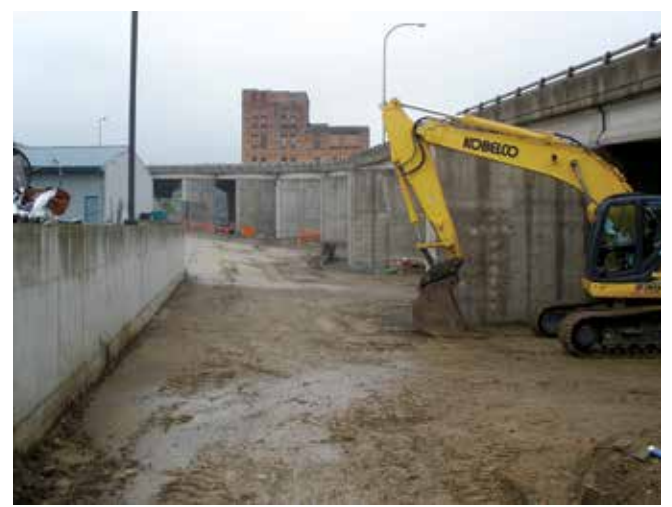
Multiple bridge piers were repaired using shotcrete with cathodic protection

was then placed over the anodes. In total, 250 ft<sup>3</sup> (7 m<sup>3</sup>) of repairs were made. This project originally mandated formand-pour concrete repairs, but Mosites Construction was able to show PENNDOT substantial savings by performing the concrete repairs with shotcrete and incorporating the cathodic protection as an additional means of corrosion protection. The pier repairs were part of a larger project lasting from September 2011 to December 2013.