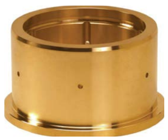
Fig. 2: Typical S tube shaft bearing

Wet-mix shotcrete pumps are usually positive displacement swing valve configurations. Swing valve designs (swing tube, rock valve, or gate valve) use very large sealed shaft bearings that