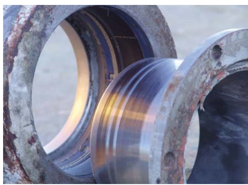
Fig. 5: Properly lubricated outlet bearing assembly at 3000 hours displays no visible wear