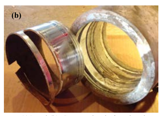
Fig. 6(a) and (b): Swing-tube shaft and outlet bearing assembly is totally destroyed at 1600 hours due to poor on-the-job lubrication practices. Note hardened concrete residue has clogged grease grooves of outlet housing on right

the wet- and dry-mix processes. He currently serves as ASA Executive Committee Secretary and newly appointed Chair of ASA's Education Committee. He continues to work as a shotcrete consultant and certified nozzleman.