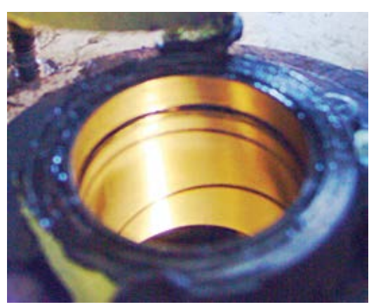
Fig. 3: Properly lubricated shaft bearing at 3000 hours

permit valve rotation between material cylinders during pumping.