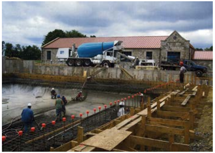
Delivering on the commitments made to the design team was largely a matter of following usual procedures for shotcrete application, including construction of solid, non-vibrating forms; installation of reinforcing steel to ensure complete concrete coverage; and a systematic, patterned approach to what was to be a multi-day shoot