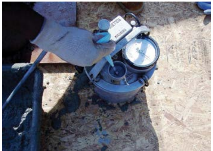
In this case, the pool was so deep that an excavator was kept on hand to ease removal of any concrete spoils or incidental rebound. Frequent tests were also conducted to make certain the shotcrete material was being applied at (or beyond) the specified strength

tive as a fully qualified contractor, but also and more important in my view, I had to convince them that, done properly, a shell made using the shotcrete-application process would be their better choice.