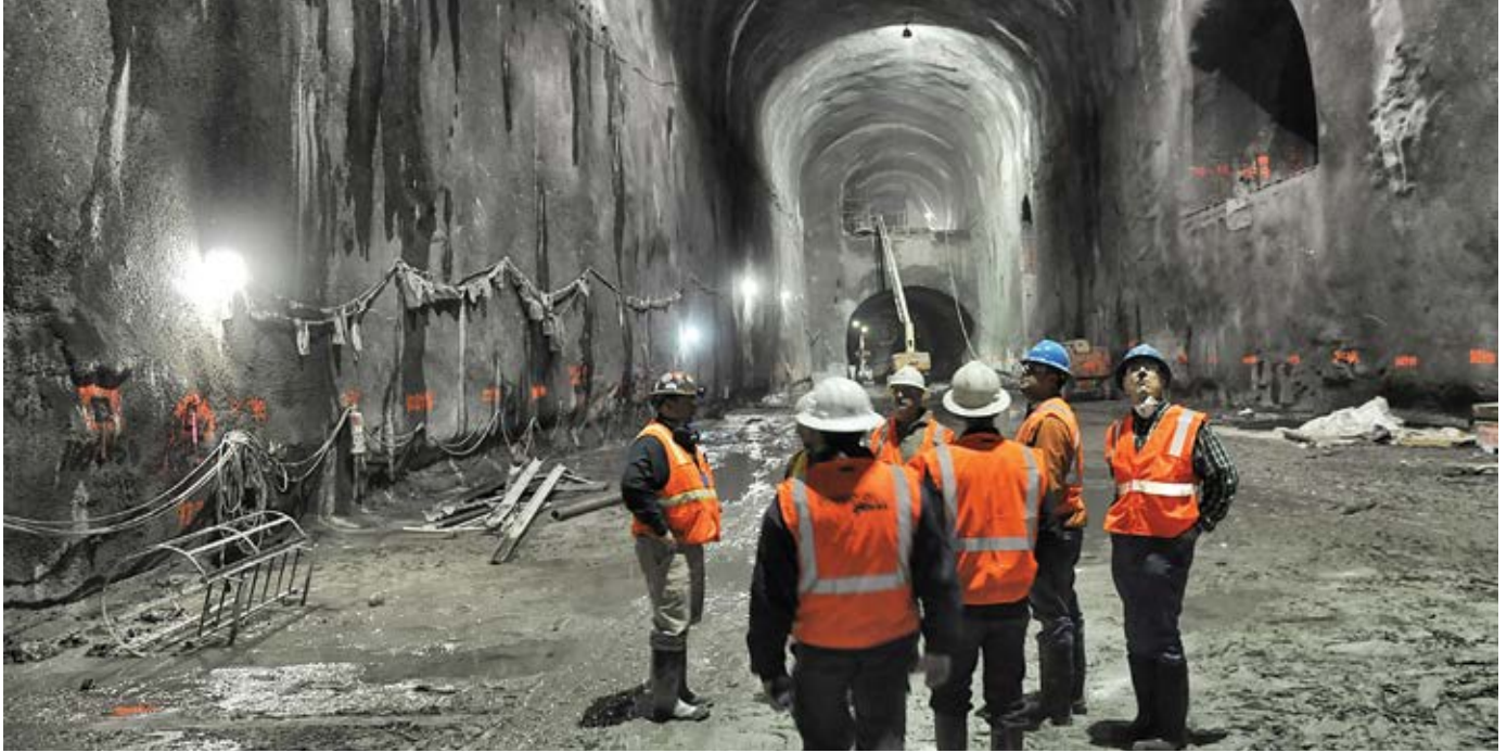
Fig. 3: Preliminary training and shotcrete scope review with team members

current nozzleman training is limited and is not designed as “one size fits all.” Many specifiers, engineers, and even shotcrete contractors are confused on this point. The New Austrian Tunneling Method (NATM) currently states that training programs should be developed specific to job parameters. Appropriate application methods, as identified in a quality control and quality assurance submission, would include nozzleman qualification pre-mockup testing and specific pumping and shooting techniques needed to place material on and around blasted rock, unstable soils, lattice girder, or ring steel. These components can be adapted and qualified prior to actual job commencement.