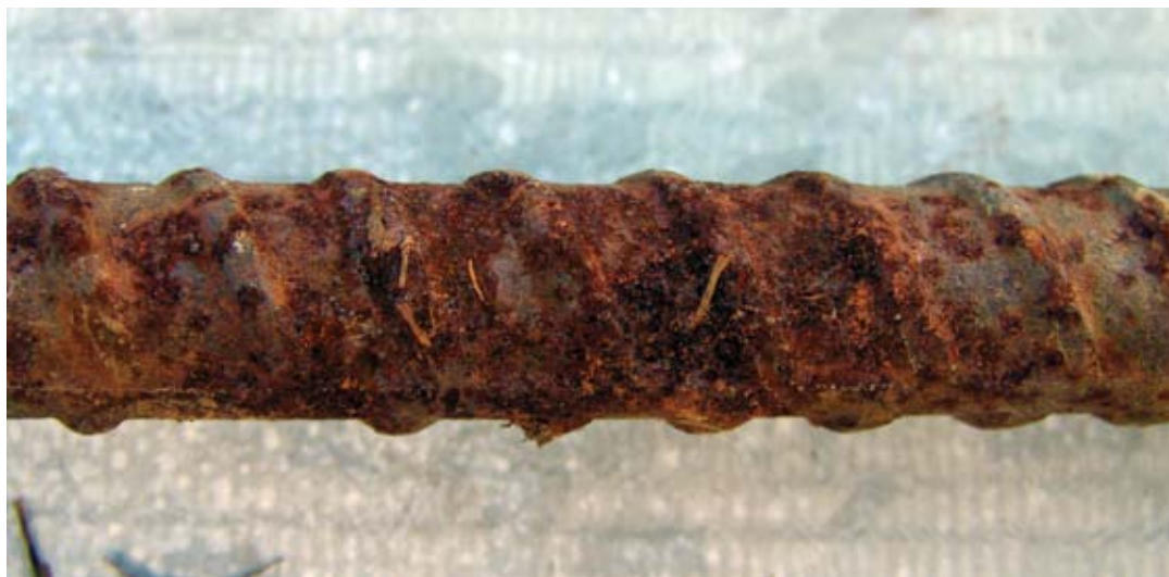
Fig. 3: Reinforcing bar with surface rust and scale

According to ACI and ASTM standards, the presence of rust alone is not sufficient grounds for rejection. For situations where the rust has progressed beyond surface rust, there may be some judgment needed in the field by both the contractor and engineer. Ultimately, the best scenario is a project where proper material handling and storage leads to reinforcing bar with nothing more than the occasional areas of surface rust.