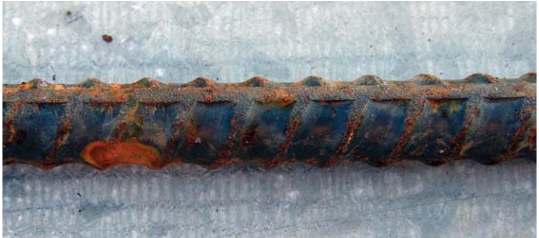
Fig. 1: Reinforcing bar with minor surface rusting

If you’ve seen reinforcing steel, you’ve likely also seen rusty reinforcing steel. Is this OK? Yes, but there are limits.