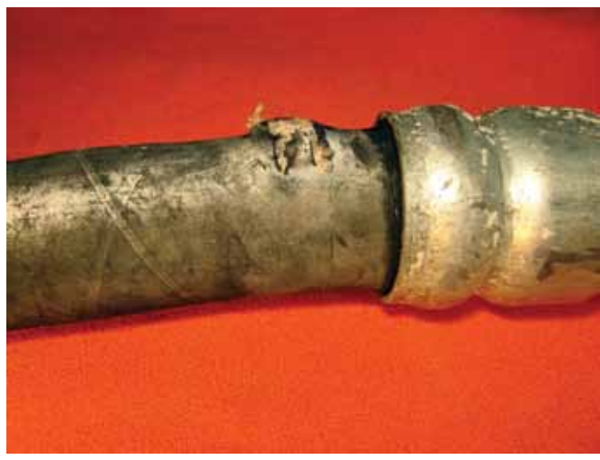
Fig. 2(a): This nearly new hose has burst within days of being run over by equipment. Note the lack of external evidence of internal abrasion damage, as seen in Fig. 2(b)