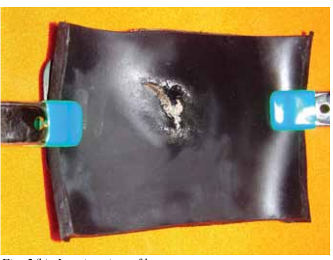
Fig. 2(b): Interior view of burst area