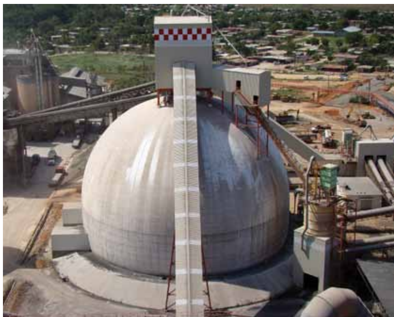
Clinker storage dome, Panama

As part of the Bayano plant expansion, DOMTEC® International, LLC, of Idaho Falls, ID, and Construcciones FASA of Mexico City, Mexico, were contracted to construct the 77,000 ton (70,000 metric tonne) capacity clinker storage dome facility.