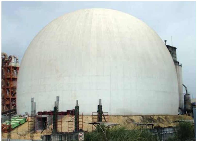
Panama dome under construction