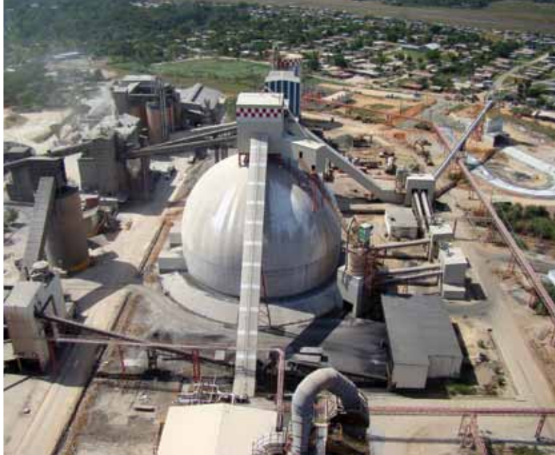
CEMEX Cemento Bayano Plant