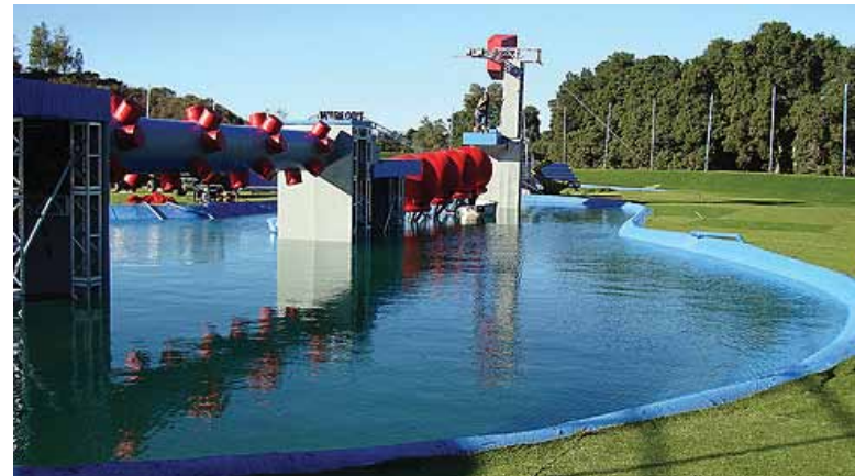
Pool shotcreted and ready for production