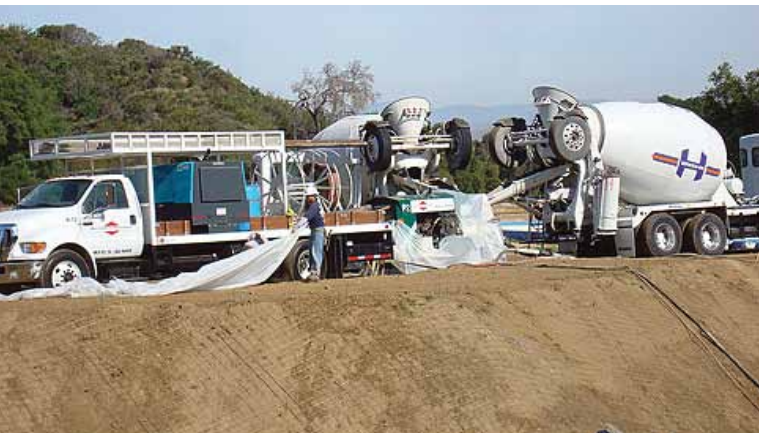
Preparing to apply shotcrete