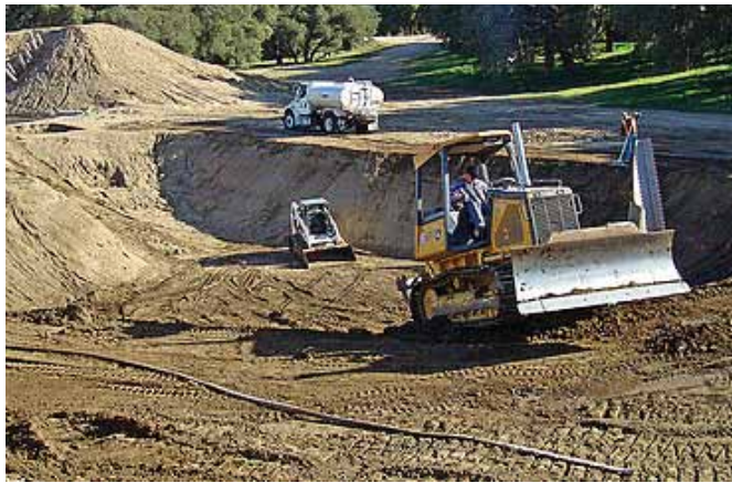
Excavation of the first pool

Excavation began with slope dozers and loaders. Due to the location of the site, water was not accessible. Instead, water trucks were there to maintain the dust control and keep the soil damp and compacted for the application of shotcrete