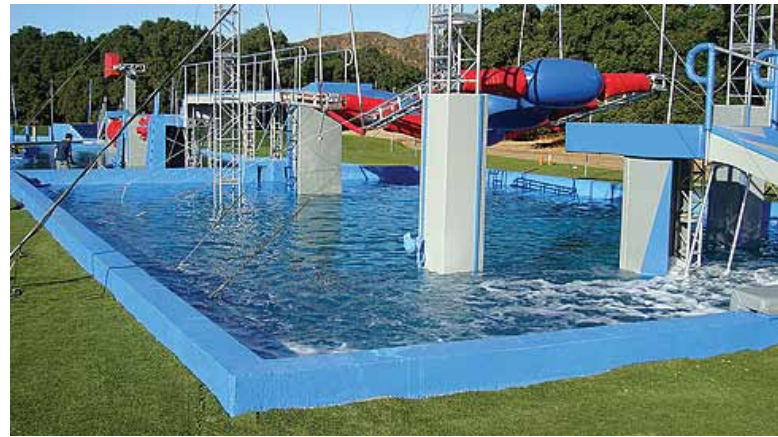
Pool shotcreted with vertical walls using no forms