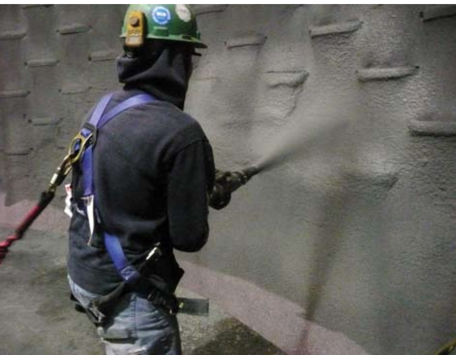
Shotcrete repair of the refractory brick lining in the lower stack section of the blast furnace

In a typical high-pressure conveying line used for shotcrete, refractory moves in the form of a cylinder, or slug, separated from the conveying line wall by a lubricating layer of water, cement, and other fines—the past components of the mixture. The refractory mixture must be designed so the slug can pass through reducers and go around bends in the line. With refractory shotcrete, however, the mixture must also be designed to be pushed through a 2 in. (50 mm) hose and have adequate reducibility. Hose blockages typically occur in the reducers. In practice, all refractory pumps have a reducer near the outlet, which can catch a problematic mixture before too much material is pumped into the pipeline and hose. Unfortunately, the passage of refractory through a reducer involves two phenomena that increase the likelihood of problems: the relatively higher paste volume required to maintain the lubricating layer and the acceleration of the refractory required to increase velocity. There is still debate today as to which place is best to position the reducer(s)—