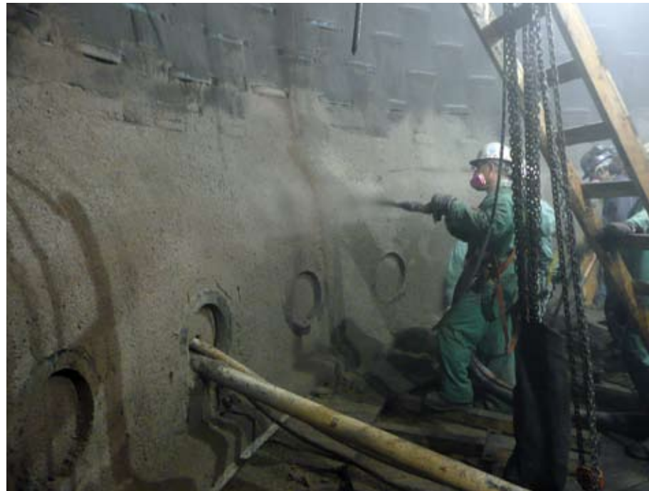
Shotcrete repair of refractory brick lining in the tuyere section of the blast furnace

When using wet-process shotcrete for refractory installation, a single high-volume combination