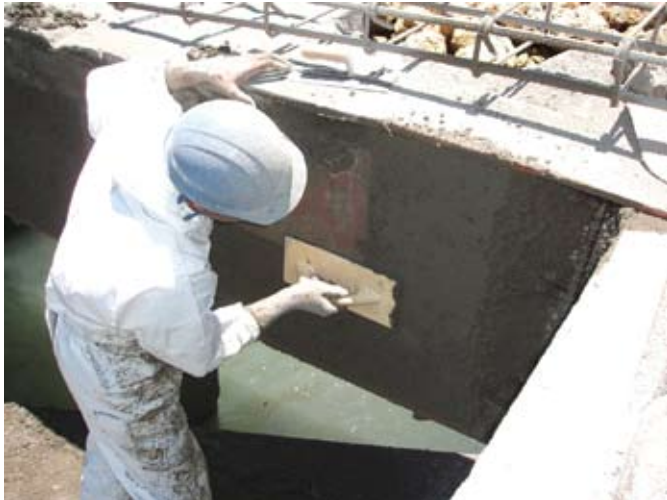
Despite continuous hot, windy conditions, the shotcrete finishers were able to provide a smooth monolithic finish that blended well with the existing concrete structures

The flexibility offered by dry-mix shotcrete and the benefits offered through prepackaged products (manufactured in a controlled factory environment) allowed Lagan construction management personnel to focus on other aspects of the project. With the results of test panels available to them, it was only a short while after the shooting process began that Lagan management had full confidence in the excellent quality of the shotcrete work.