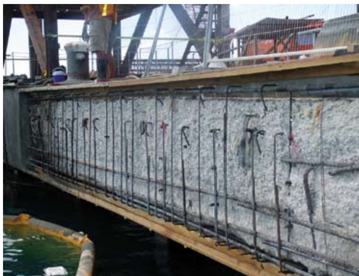
Prepared surface with timber side shutters

The successful bidder, Lagan Holdings Limited of Belfast, Northern Ireland, was awarded the contract to conduct the work and moved on site in February 2005. Due to concerns with the consistency of local products and the quality of local aggregates, Delcan specified that the shotcrete material be prebagged and produced with aggregates from an approved source. Lagan then approached King Packaged Materials Company, which, in addition to having a wealth of experience designing shotcrete mixtures for varying site conditions, had extensive experience with the overseas shipment of materials.