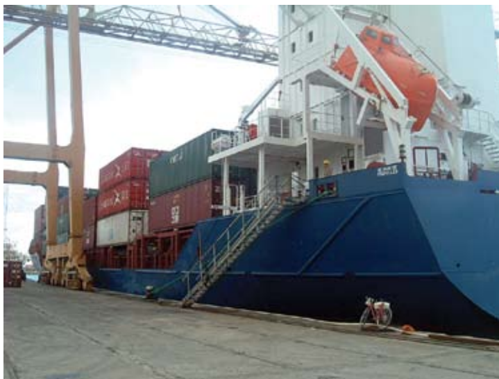
Increases in forecasted growth required that the Port of Bridgetown upgrade the existing berths and expand the cruise terminal facilities

Delcan International of Markham, ON, Canada, undertook the planning, project management, and design of the project. Careful consideration was