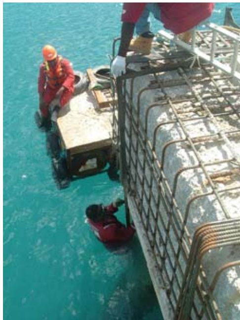
Large concrete dolphins, used to moor cargo ships, also required extensive rehabilitation