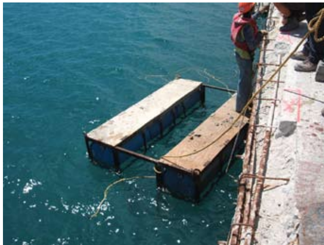
In areas with space restrictions, a specially designed floating platform allowed the nozzelman to stand slightly below the surface of the water