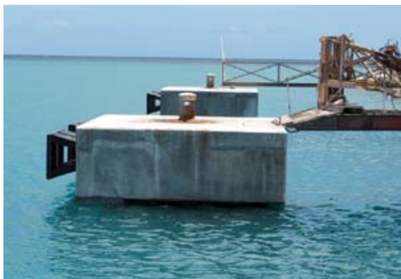
Completed repairs to concrete dolphins and wharf area