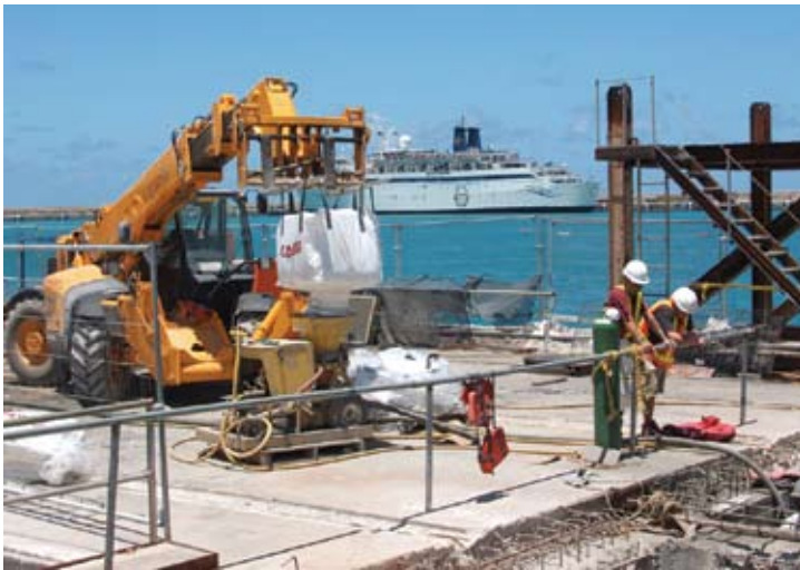
The shotcrete hoses ran from the shotcrete machine, which was stored with the prepackaged materials on the top side of the slab, to the nozzelman, positioned below