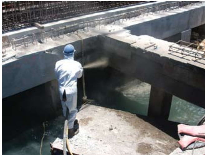
The shotcrete nozzelman stood on a large floating platform to access the vertical sides of the concrete beams and columns

During the project, King Packaged Materials' technical staff provided on-site technical assistance that provided an opportunity to exchange views with the European nozzelman, comparing the differences between the North American and European approach to dry-mix shotcreting. By the time the shotcrete portion of the project was completed, representatives of Delcan International and Barbados Port Inc. were in agreement that the quality of the shotcrete repairs met all expectations.