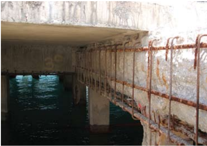
Access to the underside of the concrete wharf was difficult, especially at high tide