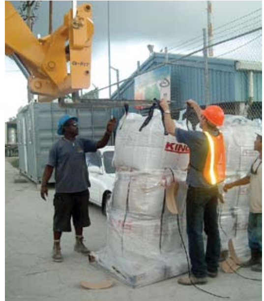
Shotcrete was supplied in special one-way bulk tote bags, lined with polyethylene, to prevent moisture from coming in contact with the cementitious material

Cold temperatures were definitely not a factor at the Reform & Expansion of Bridgetown Port project on the island of Barbados, but hot temperatures, experienced throughout the duration of the project, certainly were. The island of Barbados