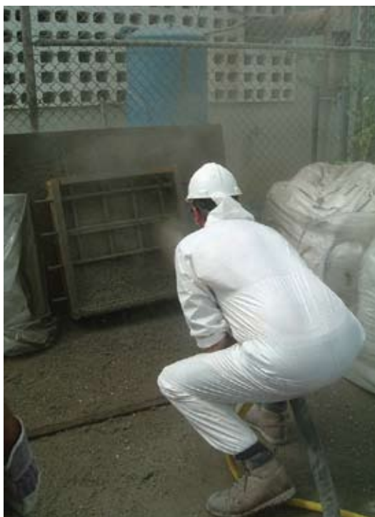
Mock-up test panels, representative of the job site, were shot to qualify the shotcrete crew and to further assess in-place compressive strength of the shotcrete

given to the construction materials specifications and the importance of curing—both extremely important factors considering the hot temperatures expected during the project.