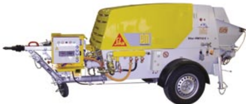
Shotcrete pump Sika-PM702