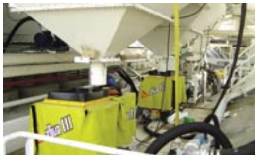
Rotor machine Aliva-263

After excavation, a layer of shotcrete is applied onto the surface of the created cavity. The functions of the shotcrete include sealing the surface and creating a supporting lining. In situations where a waterproofing membrane has to be applied subsequently, the shotcrete must also meet certain requirements regarding evenness and roughness, so that the waterproofing membrane can be installed without