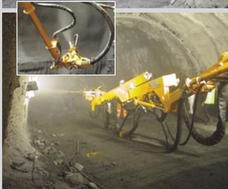
Sika-PM500PC shotcrete robotic arm at Gottard Base Tunnel (NEAT)