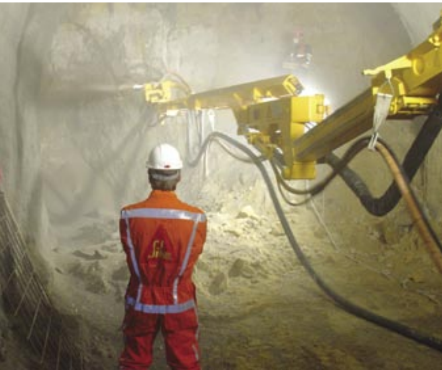
Sprayed concrete for rock support—drilling and blasting

the shotcrete mix with the correct kinetic energy and without interruption onto the rock surface. Man can improve the quality of the shotcrete layer by correct positioning of the nozzle orthogonally to the surface to be coated. Proper orientation of the nozzle to the shotcreted surface is important to minimize rebound. For the nozzleman, the manipulation of the spraying boom must therefore be simplified as much as possible. First, the admixtures used must enable the applied shotcrete layer to reach sufficient early strength within the shortest time (hardening accelerator). This is necessary to assure safe continuation of tunnel advancement in the supported zone. Second, a long open time (time during which the shotcrete remains workable) must be provided (set retarders/high-performance plasticizers/hydration-controlling