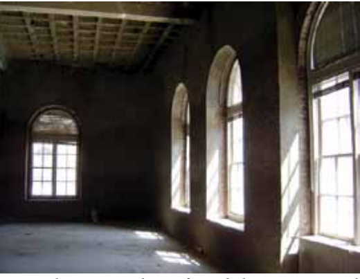
Internal corner with reinforced shotcrete around arched windows

Wooden forms were built to protect the tall, arched windows during the retrofit process. Three ft (1 m) epoxy-coated angled dowels were also installed around the perimeter of each floor