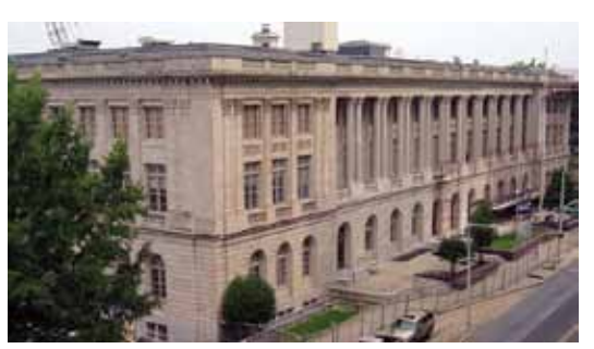
East façade of the University of Memphis' Cecil C. Humphreys School of Law during the renovation project

The 140,000 ft<sup>2</sup> (13,006 m<sup>2</sup>) building has a core that dates back to the early 1880s, but includes additions that were built in 1903 and 1929. During the major expansion and remodeling in 1929,