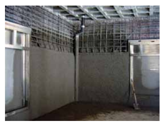
Lower portion of 18 ft (5.49 m) reinforced concrete wall

In June of 2006, Bruce Burr of Burr & Cole, CE Inc. contacted Pat Mooney of Proshot Concrete, Inc., to discuss the possibility of using shotcrete as part of the seismic retrofit. Proshot Concrete, Inc. was contacted for their shotcrete expertise to complete a seismic retrofit that would bring the building up to code. Because the building was constructed in separate phases using different building techniques, the design for the seismic retrofit wasn't the same for all parts of the structure. The original rectangular core of the building was scheduled to receive the most drastic architectural and structural design changes. It received a