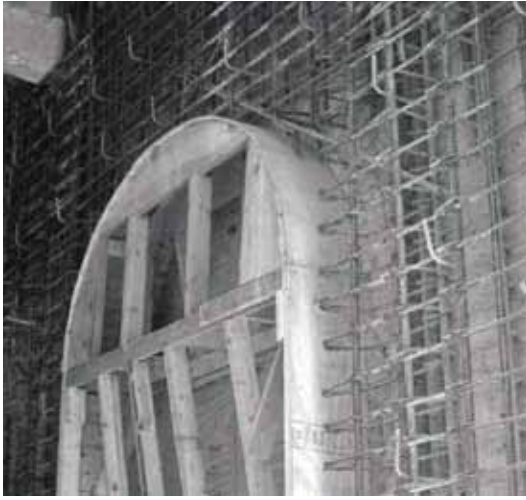
Wooden window form and reinforcement prior to receiving 12 in. (304.8 mm) of concrete

to join the exterior façade to the reinforced interior. In all, 300 tons (272.2 metric tonnes) of steel and 2000 yd<sup>3</sup> (1529.1 m<sup>3</sup>) of concrete were used throughout the building to accomplish the seismic retrofit. The specifications for the job required an average compressive strength of 5000 psi (34.5 MPa), but Proshot Concrete, Inc., was able to maintain an average compressive strength between 7000 and 8000 psi (48.3 and 55.2 MPa).