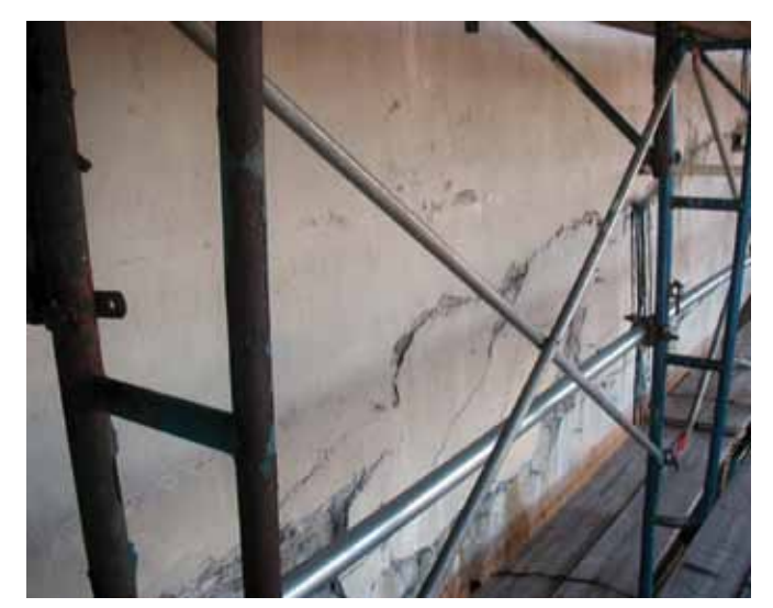
Typical minor concrete spalling