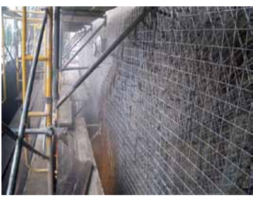
Double and triple mats of 4 \times 4 in. (100 x 100 mm) welded-wire reinforcement installed in severely deteriorated locations

A continuous soaker hose system, complete with an automatic timer and backup timer, was erected along the top of the north and south sides of the arch, not only for curing, but also to keep a saturated surface-dry (SSD) condition before application of the shotcrete. The timers were calibrated to allow sufficient water to cure and