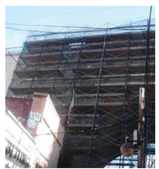
Scaffolds were erected over the elevated subway tracks and 31st Street