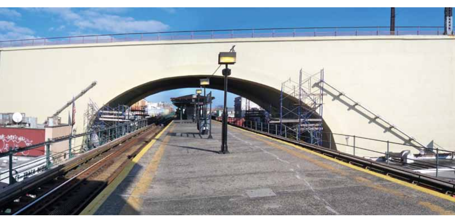
View of completed project from Ditmars Boulevard Subway Station

limited completion time. The biggest difficulty of Amtrak's Concrete Arch Bridge No. 6.45 was not that it is located on one of the most congested streets in Queens or the shoulder-to-shoulder pedestrians on the sidewalks or even the crowded adjacent NYC Subway Station and the elevated subway track running through the arch. The most difficult aspect of this job, the site Supervisor now