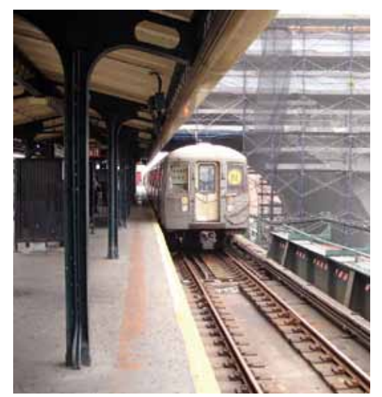
The Ditmars Boulevard Subway Station is partially inside the arched bridge

The scope of work included deteriorated concrete removal, repair of active water leaks and cracks, hydroblasting, installation of anchors and wire mesh, application of shotcrete, wet curing, and application of a coating.