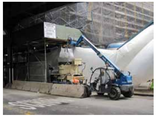
A self-contained machine was selected—one that far exceeded the necessary requirements for mixing volume and pumping distance and was capable of mixing bulk bags