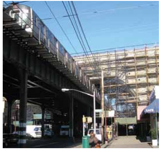
As a safety precaution, stage scaffolds and netting were erected long before the work started to protect the subway tracks and, more importantly, the pedestrians on the station platforms and sidewalks below

he New York Connecting Railroad is a rail line in the borough of Queens in New York City and forms an important element of the Northeast Corridor. The line begins at the Hells Gate Bridge over the East River; continuing south,