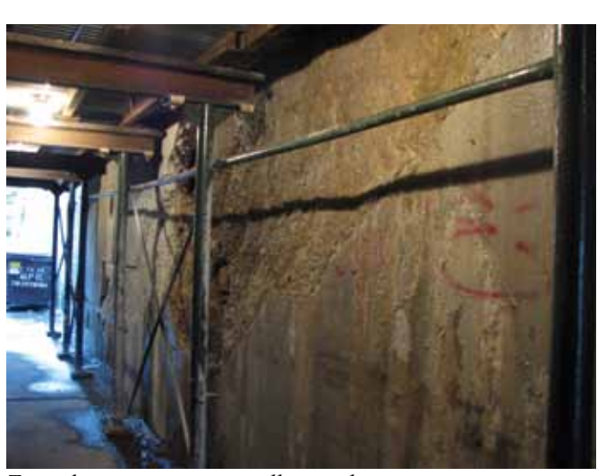
Typical severe concrete spalling with continuous groundwater infiltration

The General Contractor, ECI Building Corp of Elmont, NY, performed most of the surface preparation, starting with the north side of the structure. The substrate was sounded and marked and any deteriorated concrete was removed with pneumatic chipping hammers. Many repairs exceeded 12 in. (300 mm) in depth with continuous infiltration of groundwater. Weep pipes were installed to relieve the water pressure and a highly accelerated dry-mix shotcrete material was locally applied to divert the water to a central downward flow. The substrate was then hydroblasted to remove all existing coatings, contamination, and graffiti and "roughen" the surface to a minimum of 0.25 in. (6 mm) amplitude. L-shaped No. 3 dowels were installed 36 in. (900 mm) on center (OC) and coated 4 x 4 in. (100 x 100 mm) x D2.9 x D2.9 welded-wire reinforcement was attached to the dowels.