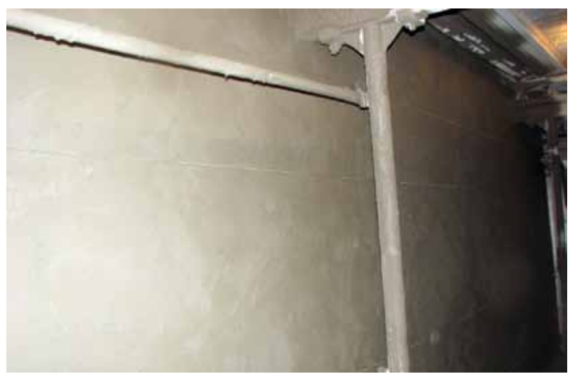
The uniformed float finish provided an excellent textured surface for the coating adhesion

to minimize and control the dust and rebound. Dry-mix shotcrete was not an option for the overlay. The shotcrete Subcontractor, East Coast Shotcrete of West Orange, NJ, elected to use King Packaged Materials Company's MS-W1 Shotcrete, which was submitted to the project engineers for approval. Before beginning the shotcrete process, six 30 x 30 x 6 in. (760 x 760 x 150 mm) preconstruction test panels and three mockup panels were shot by two different ACI Certified Nozzlemen and by the jobsite Supervisor (also an ACI Certified Nozzleman). Six cores were extracted from each panel and a 28-day compressive strength (ASTM C42) revealed that all cores exceeded 6000 psi (41.4 MPa). Flexural strength testing (ASTM C78), which was also a requirement, was performed, and the results exceeded the minimum strength by an average of 25%. The mockup panels represented the final finish and color of the bridge. Six different shades of coating were applied to the mockup panels for the owner's selection of the color and acceptance of the finished shotcrete texture.