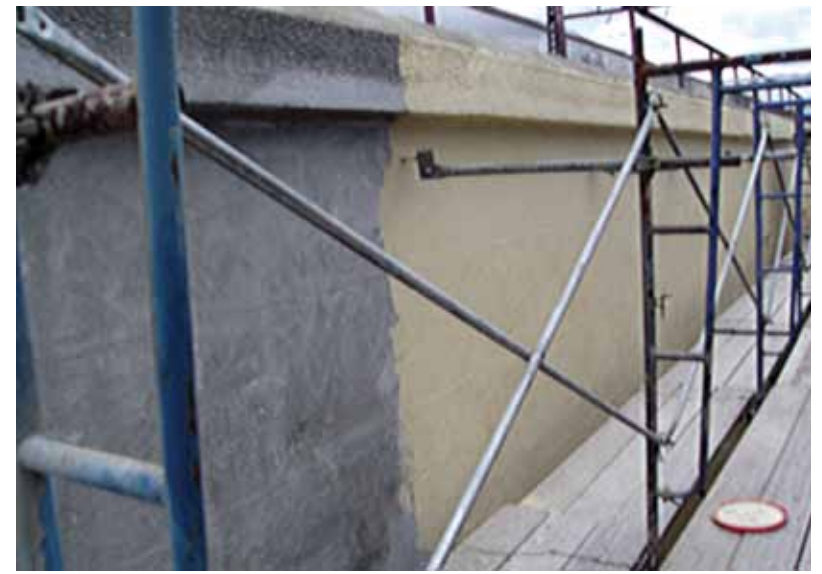
Two coats of a water-dispersed, acrylic, anti-carbonation coating were applied

Spalling, cracking, water leakage, staining, surface erosion, and outdated design are common problems with many old concrete structures. Other problems that are often encountered are poor original quality and porous concrete, presence of chlorides or carbonation, and deterioration due to lack of maintenance. This bridge had all of these issues, in addition to a few others.