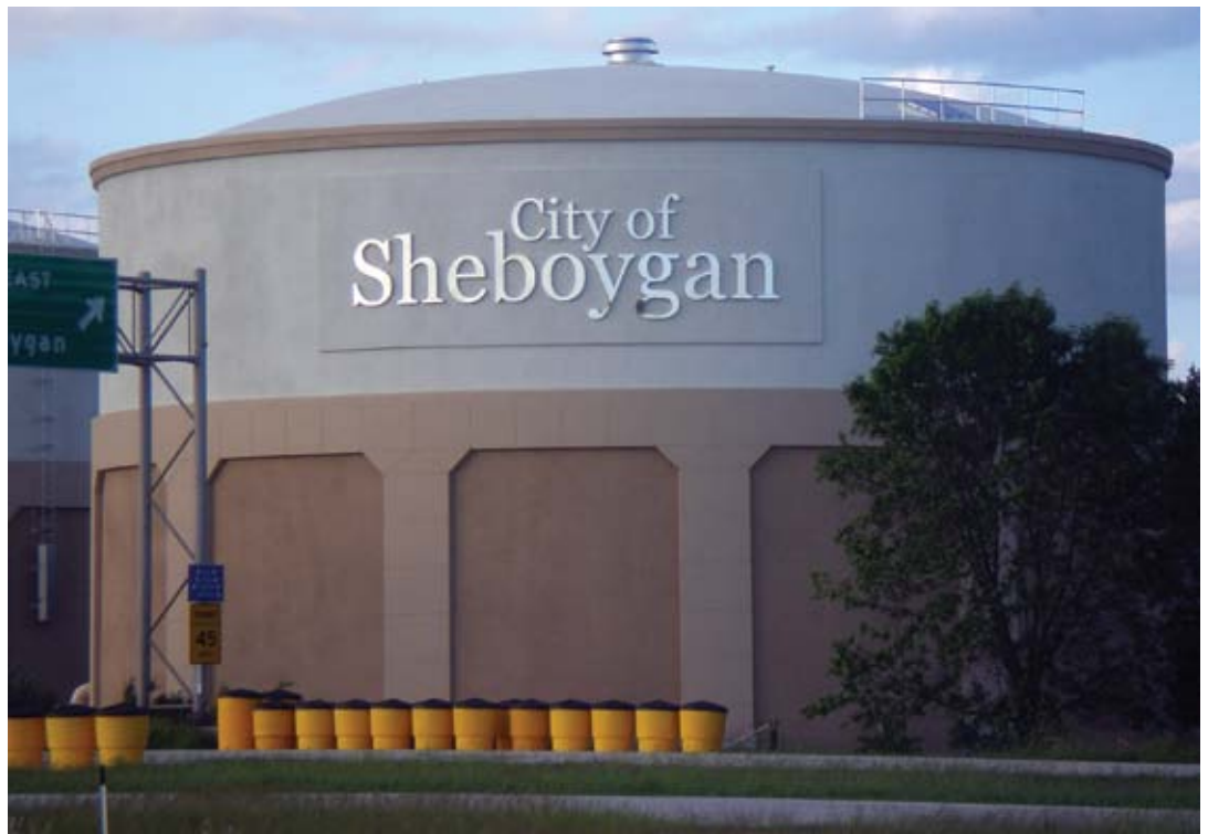
Fig. 7: Tank in Sheboygan, WI