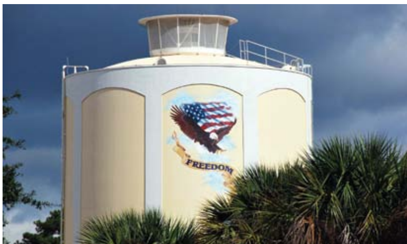
Fig. 1: 750,000 gal. (2,839,059 L) tank, Gainesville, FL

In Fig. 2, the shotcrete cover coat is nearly complete. An oval temporary manhole is still open. The permanent manhole—about one-third the height of the wall above grade—is open. Shotcrete corbels are reinforced using T-shaped bolts to tie back to the tank core wall. These corbels will act as a shelf to support the brick pilasters. Vertical strips of dovetail anchors are shotcreted in a 1 in. (25.4 mm) pad (beyond the 1 in. [25.4 mm] of shotcrete covering the prestressing wires). The brick ties back to the dovetails, leaving an air gap between the shotcrete and brick. The brick contains weep holes at the first course above grade, and the sides between the brick and the shotcrete are caulked with a backer rod.