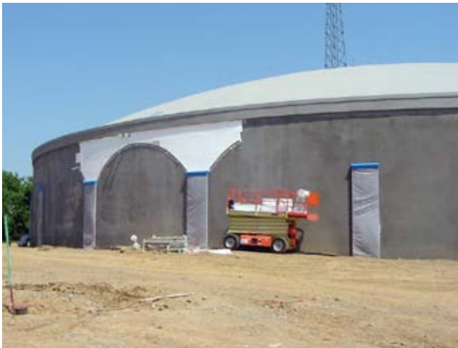
Fig. 3: EIFS arches being placed, East Hazel Crest, IL