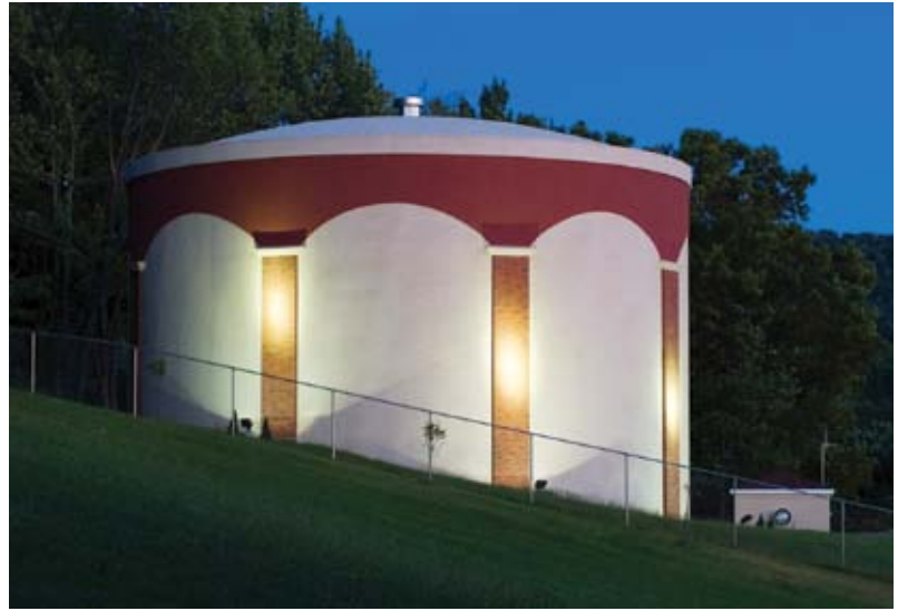
Fig. 11: Night view of tank in Vestal, NY

In summary, WPCTs are extremely durable structures built with concrete and shotcrete to last up to 100 years. Unfortunately, many people see normal cylindrical concrete tanks as unattractive, utilitarian structures. As can be seen in the photos, however, with the creative use of paint, shotcrete, EIFS, brick, and stone veneers, today's tank builders are able to create visually attractive tanks that can be proud landmarks for the municipalities they serve. Now the neighbors can say, "Sure, I'll have THAT in my backyard!" Of course, they will also appreciate the improved water pressure.