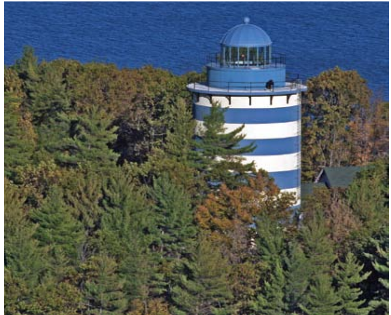
Fig. 12: Lighthouse tank in Laconia, NH