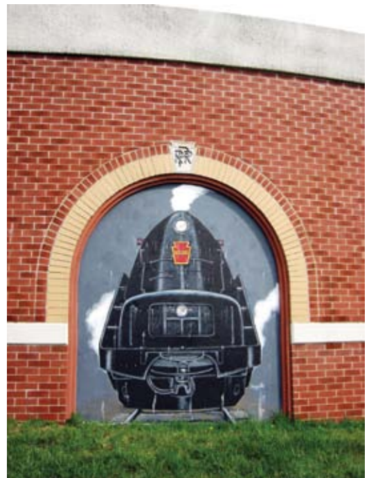
Fig. 9: Close-up view of tank in Altoona, PA

Figures 8 and 9 show another WPCT—built by the Natgun Corporation from Wakefield, MA—for the city of Altoona, PA. The aerial shot shows how NIMBY could have been a big