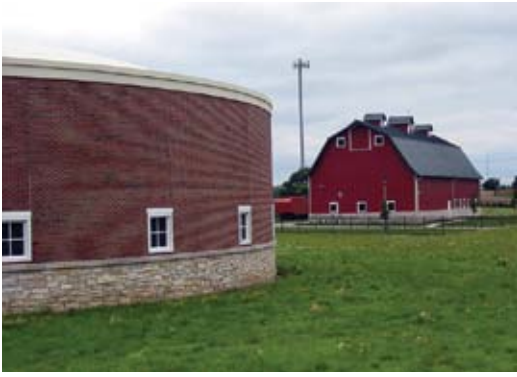
Fig. 10: Stone-brick veneer tank with barn pumphouse