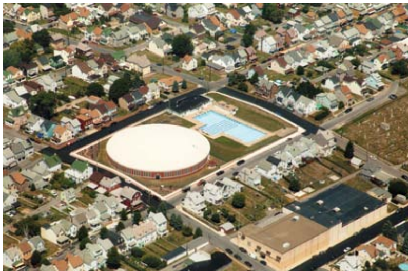
Fig. 8: Aerial view of tank in Altoona, PA

construction, whereas the upper portions use an EIFS system.