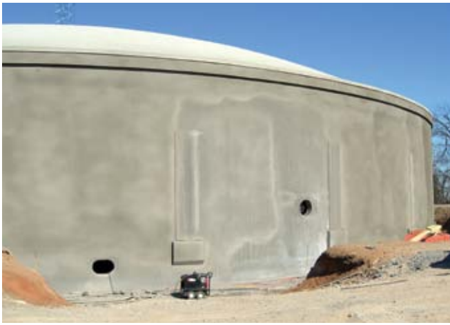
Fig. 2: Shotcrete corbel and pilaster on a 1,000,000 gal. (3,785,412 L) tank, East Hazel Crest, IL