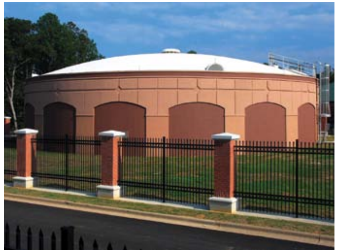
Fig. 6: 1,000,000 gal. (3,785,412 L) tank, Tuscaloosa, AL