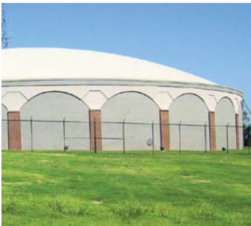
Fig. 4: Finished tank, East Hazel Crest, IL

In Fig. 3, the final shotcrete flash coat is complete. The brick pilasters have been placed and masked for construction of the EIFS arches. Polystyrene is glued to the tank wall with a permanent adhesive and then coated with a mesh reinforced latex-modified acrylic mortar.