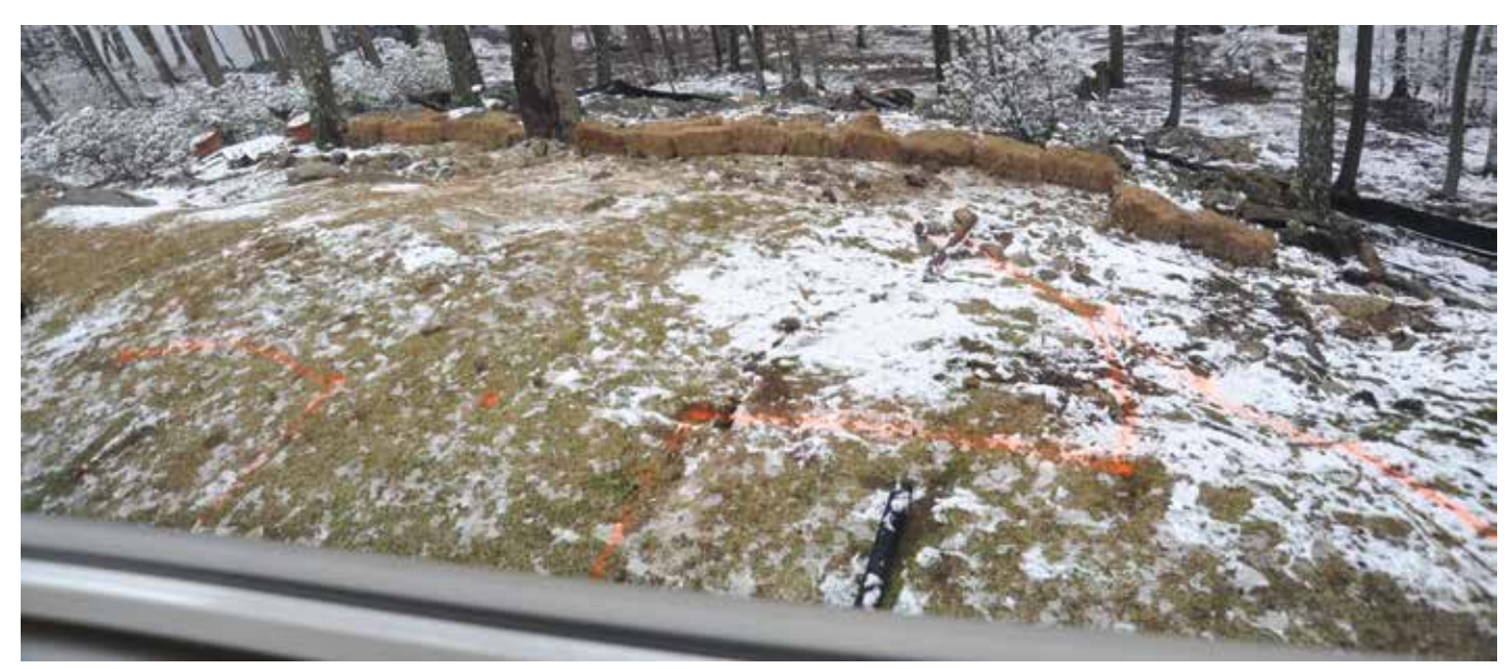
Fig. 1: Dramatic slope bordering construction area

The unique topography and geological conditions necessitated the construction of a "keyway" for the bottom of the shotcrete pool. This concrete-filled trough in the natural rock forms a keyway to lock the pool structure into the existing rock ledge and provide horizontal restraint for the structure to keep its position on the very brink of the cliff without movement.