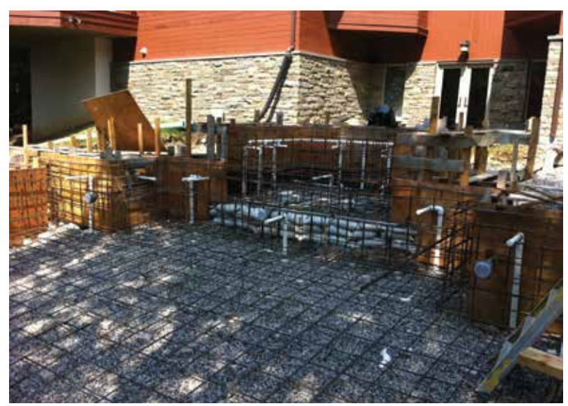
Fig. 6: Intricate but efficient formwork, steel, and plumbing installation prior to shotcrete placement