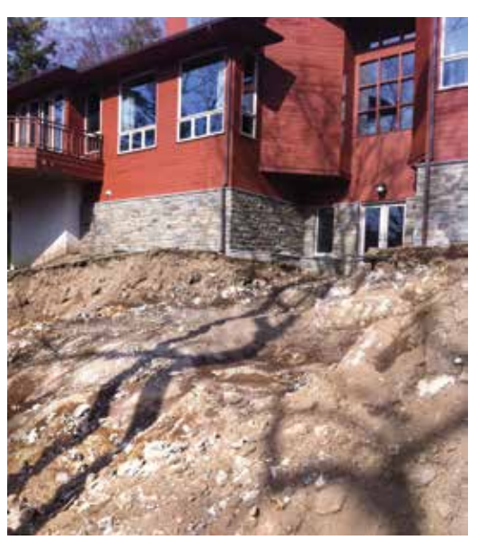
Fig. 3: Rock hammering and ledge removal

The next phase was forming and reinforcement installation (refer to Fig. 6). Forms were one-sided, rough-sawn lumber (2 x 4 in., 1 x 6 in. [50 x 100 mm, 25 x 150 mm]), accompanied by sheets of plywood. Because half of the pool installation was to be an out-of-ground build, intricate