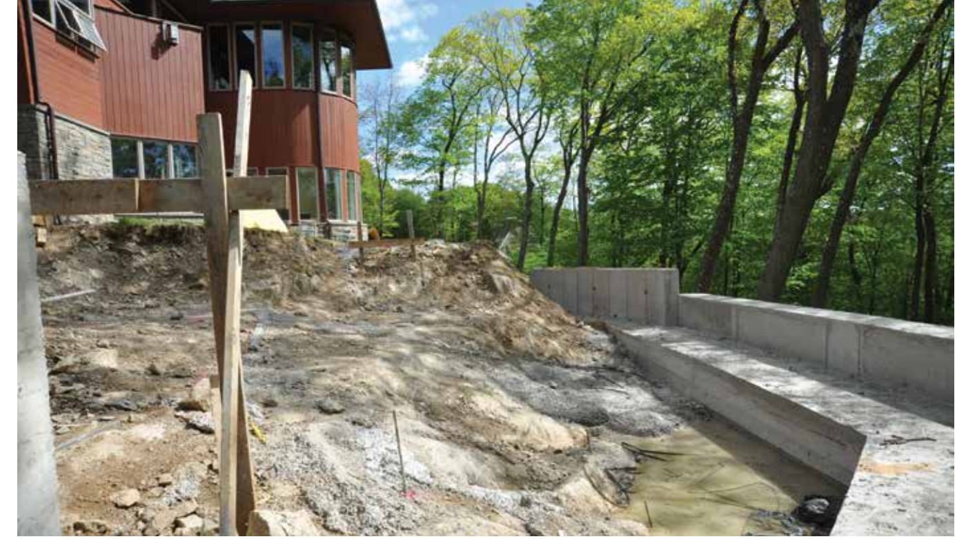
Fig. 5: Cast-in-place concrete footing to support pool structure