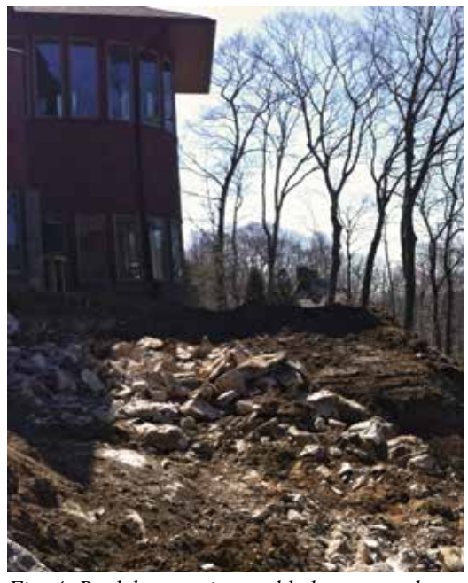
Fig. 4: Rock hammering and ledge removal