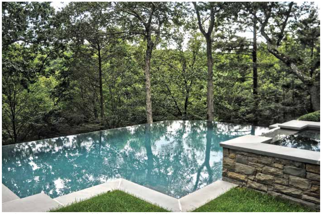
Fig. 9: Native stone in harmony with house and surrounding landscape