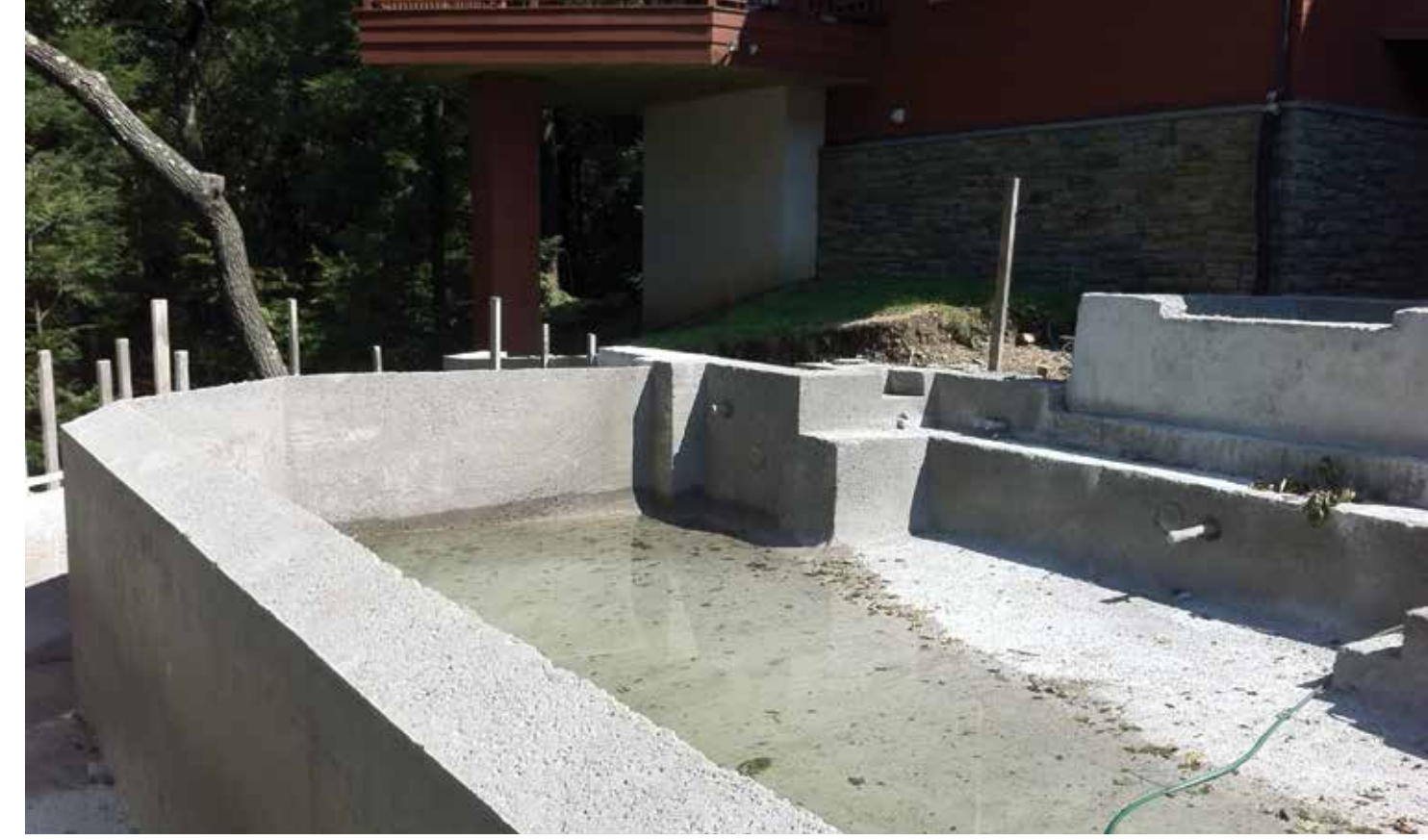
Fig. 8: Completed shotcrete structure undergoing 28-day wet cure to achieve high strengths of 6000 to 7000 psi (40 to 48 MPa)

detail work and achievement of key tolerances throughout the installation was critical. Following the 3-day shoot, the pool was water-cured and tank-tested to ensure not only strength gain but also water-tightness (Fig. 8). After a 28-day wet cure, tests revealed strength values between 6000 and 7000 psi (40 and 48 MPa).