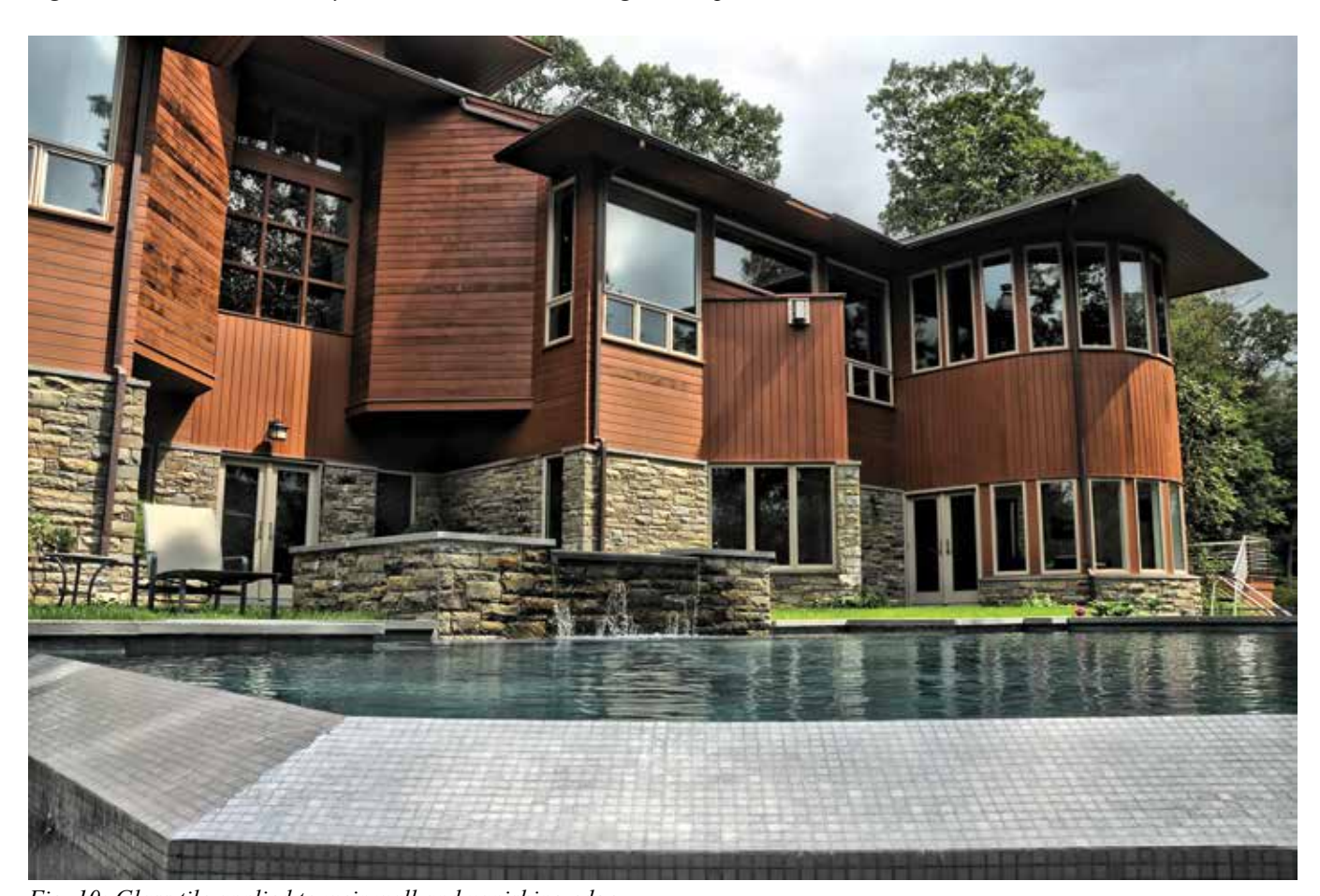
Fig. 10: Glass tile applied to weir wall and vanishing edge