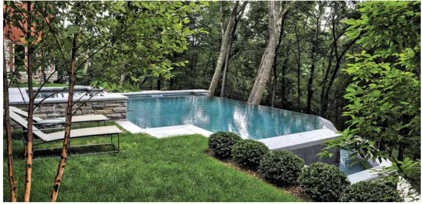
Fig. 11: Three-tier system complete and running

As perverse luck would have it, the local area was wracked by a hurricane, a tropical storm, an earthquake, a tornado, and a freak October blizzard that knocked the power out for 7 days. After this brutal round of foul weather (and with an unmoved, sound installation), Bill Drakeley humbly inquired if the shotcrete structure required further testing and verification. It didn't. The project was approved, albeit a bit later than hoped.