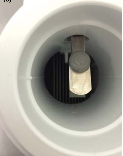
Fig. 3: Close-up views of a residential salt cell: (a) information it provides and the adjustments that can be made; and (b) close-up of the flow sensor which shuts the cell off when there is insufficient flow. Also shows the fins that provide the charges that separate the ions as the salt water passes through