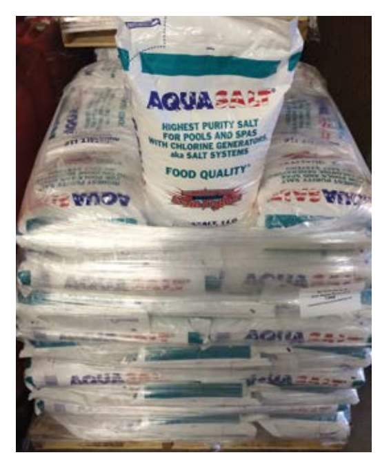
Fig. 2: This is one brand of salt that is used they all work pretty much the same. These are 40 lb (19 kg) bags; residential swimming pools typically need 25 to 30 bags (roughly 1000 to 1200 lb [454 to 544 kg]) to get a salt system started

will do the same; however, it will take much longer to see the effects and for the pool to turn green. Salt needs to be added to the pool occasionally along with muriatic acid to maintain the correct pH level of 7.2 to 7.8. When muriatic acid is not added to a saltwater pool, the pH will rise, and the pool will become low in chlorine and high in the oxidizer ion, hypochlorite. This will not be nearly as visually obvious as the pool turning green when using with chlorine. The hypochlorite is a very aggressive chemical and will begin to eat away at everything it can-the pool plaster, metal railings, heater internals, and just about anything around the pool that is susceptible to corrosion-while the low chlorine level will keep the pool from turning green.