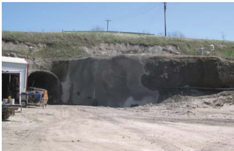
Fig. 8: High wall and portal completed

of applying new shotcrete to the tunnel portal and high wall to provide stabilization to the friable and unstable exposed rock faces. After scaling these surfaces and cleaning them with high-pressure washing, we placed about 150 yd 3 (115 m 3 ) of shotcrete in 1 week to complete the extra work.