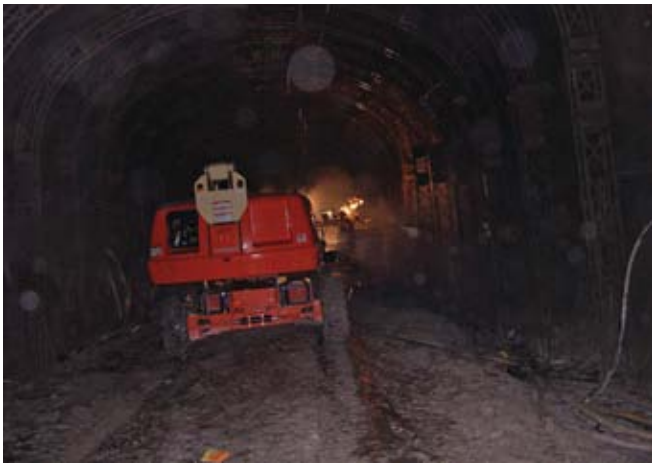
Fig. 2: Surface preparation by high-pressure water blasting