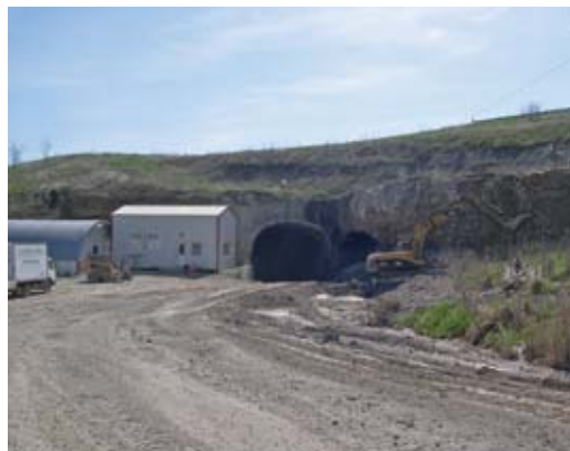
Fig. 6: Scaling loose rock from high wall