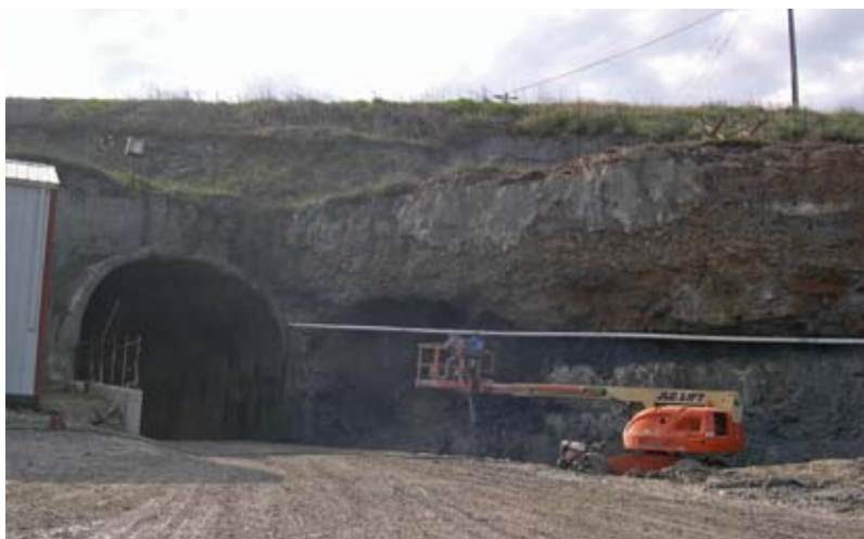
Fig. 7: High-pressure water blasting to prepare high wall for shotcrete