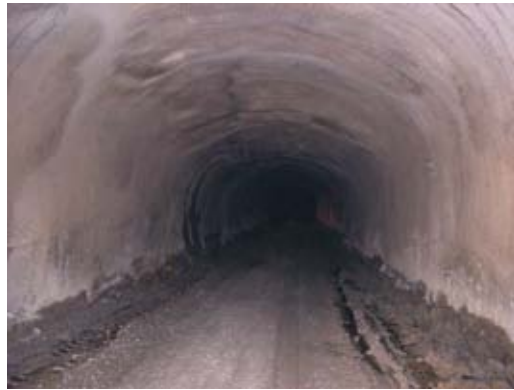
Fig. 4: Completed section

Upon completion of work in the tunnel, the owner directed us to perform the additional work