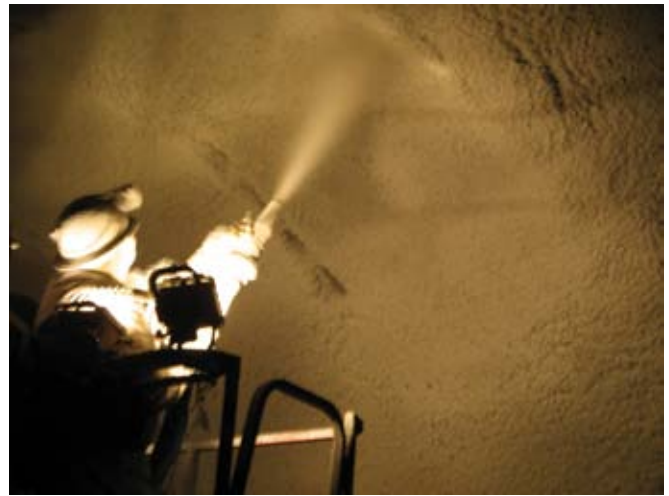
Fig. 3: Shotcrete placement

manufactured by The Euclid Chemical Company was the perfect solution. With this accelerator, we were able to place approximately 4 in. (100 mm) of shotcrete overhead, allow it to set for approximately 1 hour, and then place another 4 in. (100 mm). This allowed us to place upward of 12 in. (300 mm) of shotcrete thickness in an overhead application in a single shift.