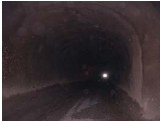
Fig. 5: The light at the end of the tunnel