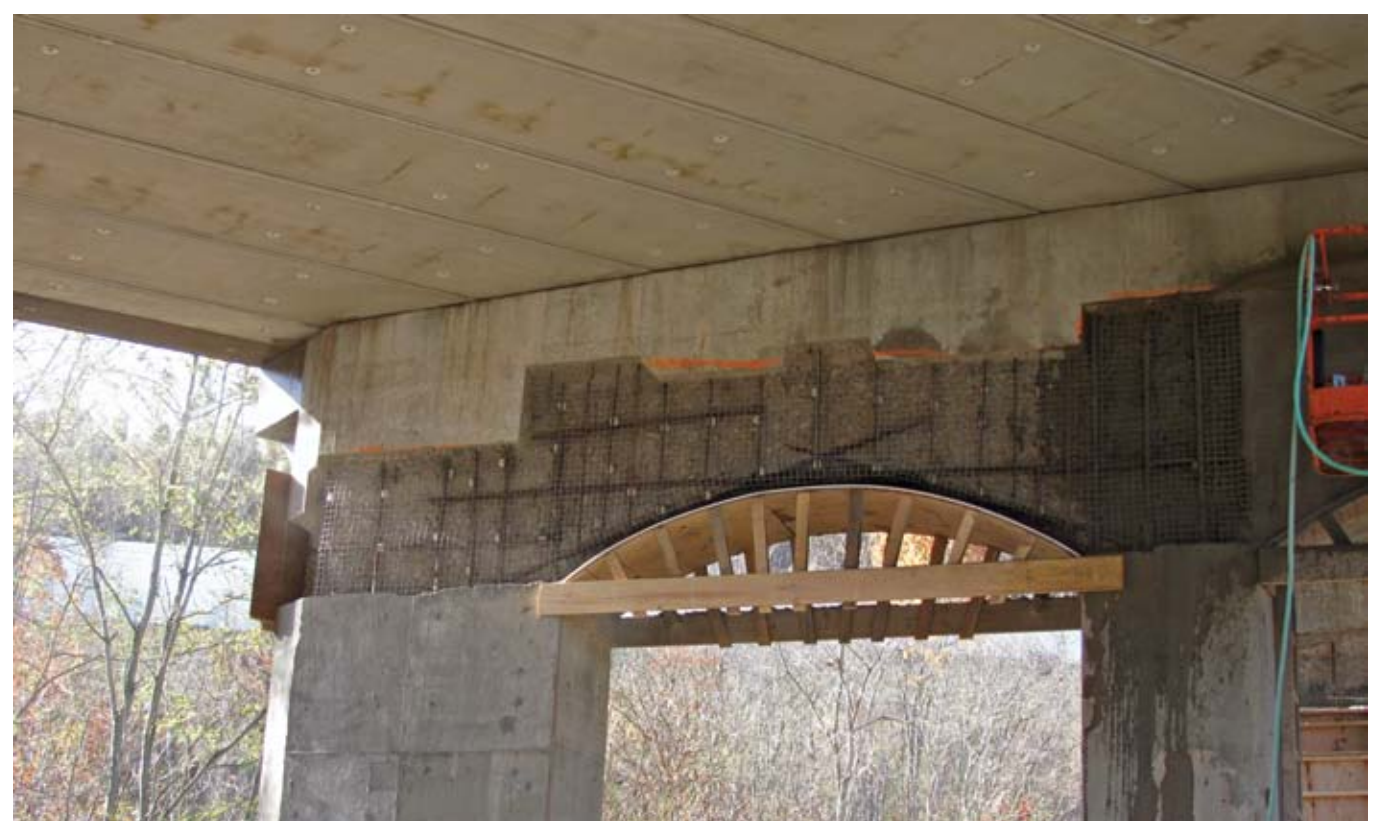
Fig. 2: Wire mesh and anodes installed prior to material installation

method of repair. SMCI felt the shotcrete method would be ideal for this project due to the nature of repairs that included many start-and-stop repairs on the structure. SMCI also saw the benefit of saved forming time and the significantly reduced use of forming materials. ODOT almost exclusively specifies "form and pump" or "handapplied trowelable mortars" as their preferred repair method on bridge structures throughout Ohio. Multiple meetings were needed with District 11 to demonstrate and discuss the benefits of the shotcrete method. SMCI placed test patches and shot test panels to help make ODOT comfortable with the proposed shotcrete method of repair. Eventually, ODOT, District 11, signed off on the dry-process shotcrete method for repairs, where SMCI proved it was beneficial and made sense to the project.