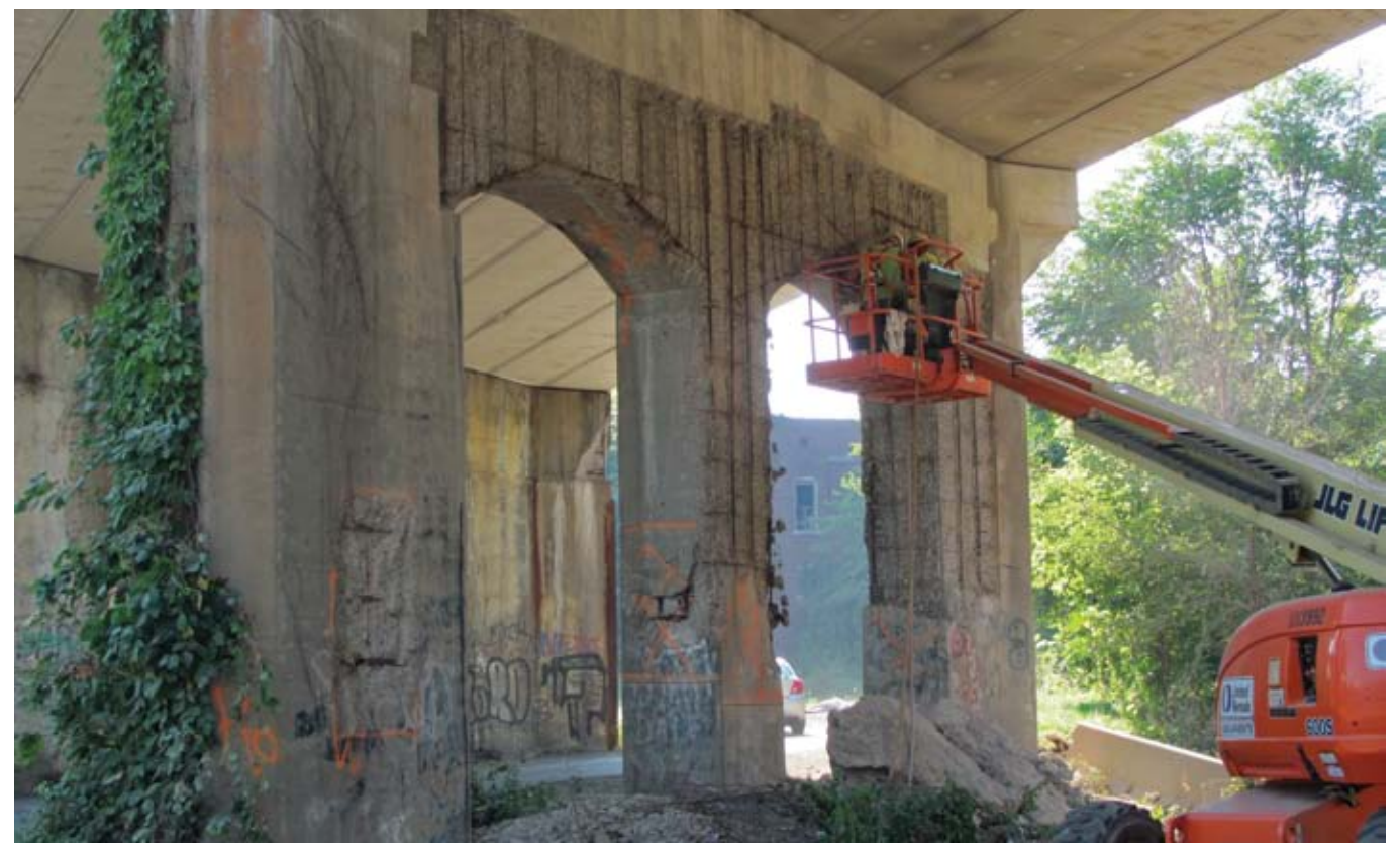
Fig. 1: Deteriorated concrete being removed during demolition

This project (ODOT 248-10) was specified to be repaired using the form-and-pump method of repair, along with hand-applied trowelable mortars. SMCI requested that ODOT, District 11, consider the shotcrete method as an alternative