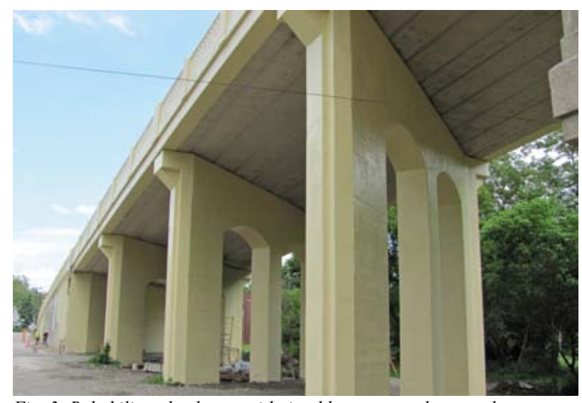
Fig. 3: Rehabilitated columns with tintable epoxy urethane sealer

SMCI used ACI-certified nozzlemen to perform the shotcrete work on the bridge rehabili-