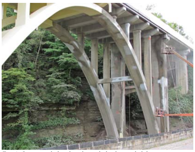
Fig. 4: Open spandrel arch and spandrel column rehabilitation

sealer was applied to the entire concrete structure for added durability, protection, and overall aesthetics. In addition to the substructure rehabilitation, the bridge deck received a microsilica concrete overlay.