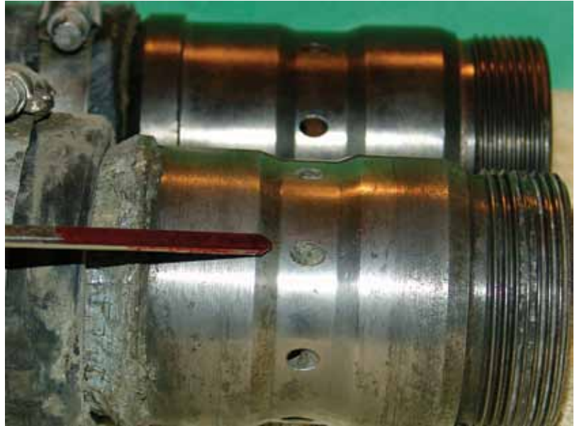
Fig 4: Note plugged port within nozzle body