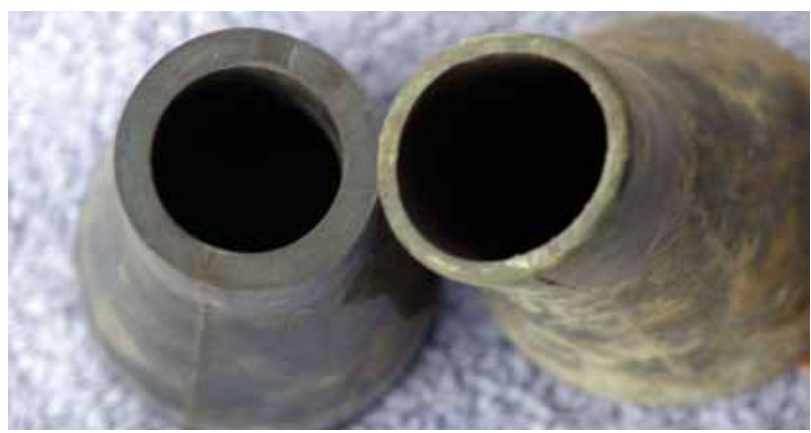
Fig 6: After placing only 80 lb/yd^3 (60 kg/m<sup>3</sup>), the worn tip on the right has become oversized and must be discarded

if you suspect a partially plugged nozzle, and clean or replace the nozzle.