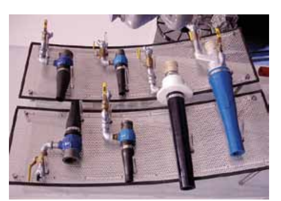
Fig 1: A few of the countless wet-mix nozzles currently available