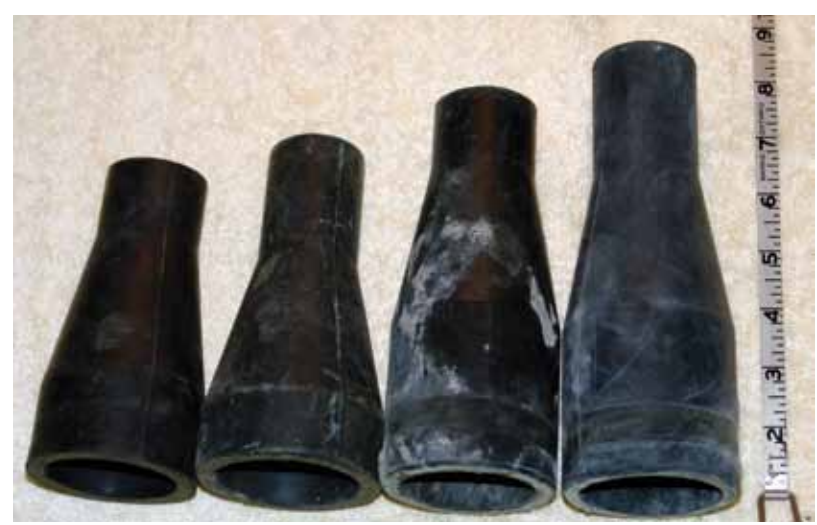
Fig 5: Nozzle tips are available in many lengths for varying placement conditions