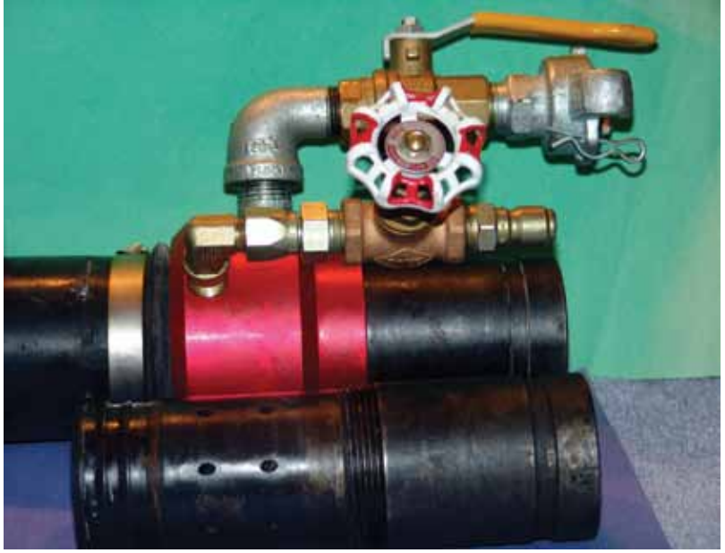
Fig 2: Note second valve supplying second row of drilled ports on wet-mix admixture nozzle

A well-designed wet-mix shotcrete nozzle must do many things to achieve acceptable compaction. The nozzle must allow enough air volume uniformly into the air ring and the ports within the nozzle body to completely break up the supplied mixture into fine particles. Unfortunately, many early nozzle designs were not up to this essential task. Most modern designs use much larger air rings and valves in conjunction with bigger drilled ports within the nozzle body to deliver higher diffusion energy to the mixture. If, for any reason, the material is not completely diffused into small particles during this step, they will exit the nozzle as larger masses. These "lumps" or "slugs" will then gather at the receiving surface as loosely consolidated masses. Typically, the larger the drilled port, the better it will diffuse the mixture. Always choose a nozzle that will allow adequate air volume to completely diffuse the mixture.