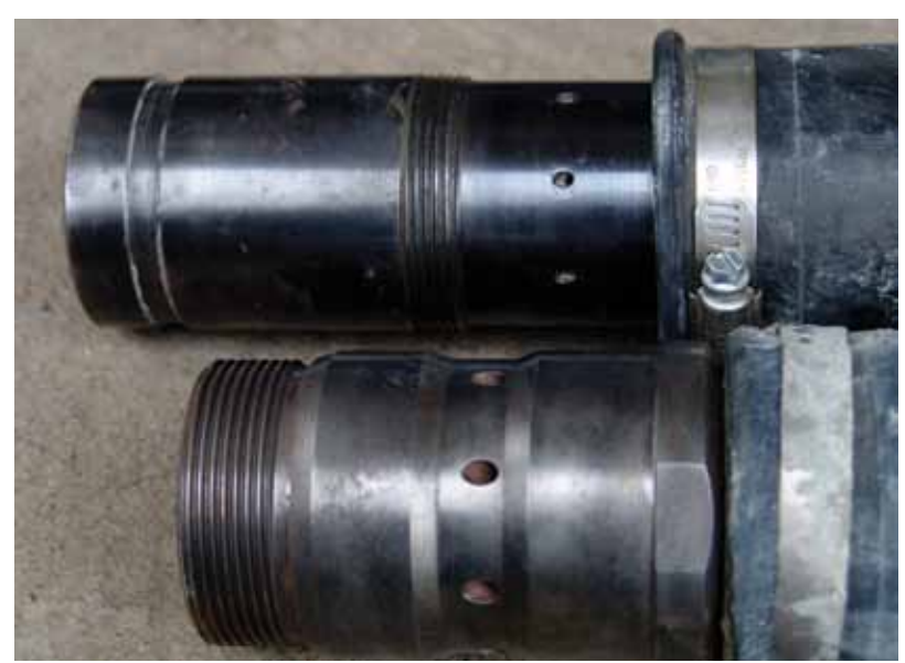
Fig 3: Nozzle body above with 1/8 in. (3.2 mm) drilled ports. Nozzle body below uses 3/16 in. (5 mm) ports and adds chamfer to increase air flow

The ports supplying air from the air ring through the nozzle body can plug with material during use if the air supply line is stopped or kinked for even a moment. When a nozzle is set down, always leave the air supply line open a little to maintain pressure to the air ring to prevent ports from plugging. A nozzle with partially plugged air ring holes will not be able to properly break up the material and will not provide an adequate velocity or spray pattern to the receiving surface. During placement, stop work immediately