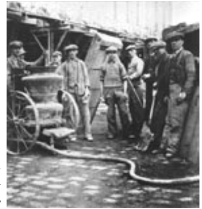
1920s Gunning Crew

In the community, there was abundant understanding of and interest in cement and concrete, concrete construction methods, and design and fabrication for a commercially viable machine to apply materials, as invented by Carl E. Akely. The first machine was introduced at the Cement Show in New York in December 1910.