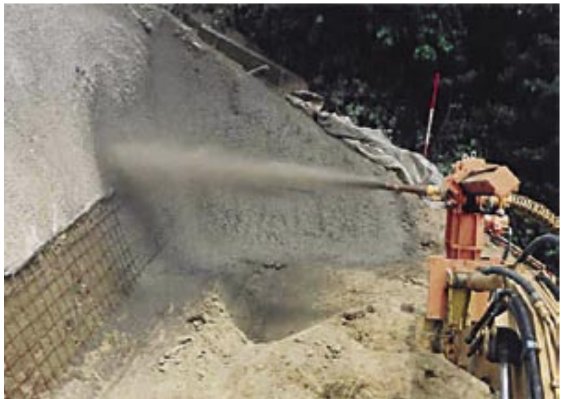
Automated wet shotcrete for a geotech application

and delivered to meet any need—site-batched, in a bag, or in a truck. Ironically, the success of wet-mix shotcrete has been achieved by combining modern material and equipment technologies with the patented basics of the original invention. Sound, well-graded materials combined as a concrete for placement at high velocity to achieve sufficient compaction to perform at levels above similar cast materials. And the neat thing is, you can place it upside-down if you like. Today, it is possible to achieve similar results in all phases of shotcrete construction with both wet- and dry-mix shotcrete methods. Properly understood, they are a screwdriver and a wrench. Which one is better? Depends on the task. What’s really important