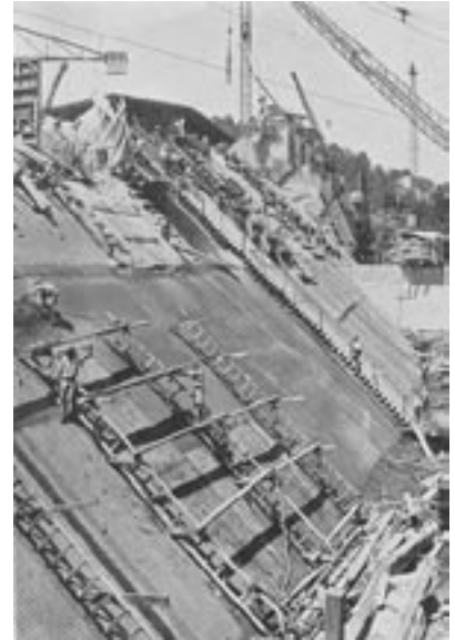
Gunite overlay for water proofing was done during construction of Chendorah Dam, Federated Malay States, c1930

We'll assess the "recovery" in Part III.