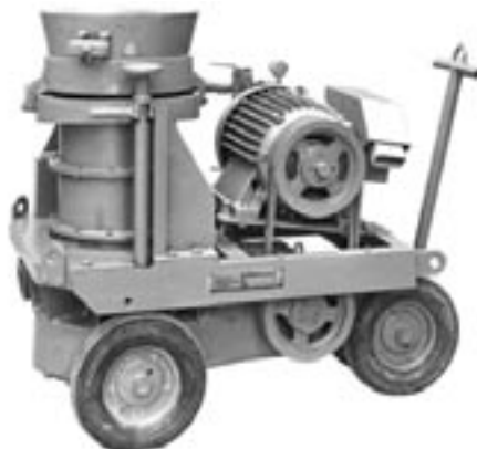
Meyco GM 57 rotor type machine