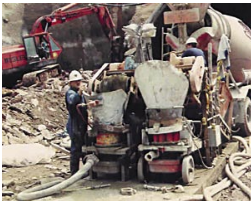
The introduction of the Rotary Gun in 1957 paved the way for large aggregate and high-volume shotcrete

The early years of large aggregate, high-output, dry-mix shotcrete set the pace for the soon-to-be-developed wet-mix method, especially in underground construction. Shotcrete was proving to be invaluable as a method for supporting rock and earth excavations in tunnel and mine construction. High volumes placed in many underground projects (50,000 yd 3 [38,000 m 3 ]) was common