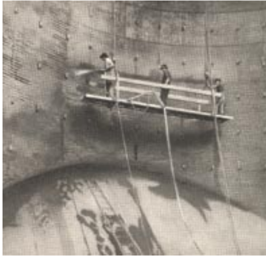
Restored, reinforced gunite flue at American Smelting and Refining Co., Helena, Montana, 1924

requirements, and only material placed by a genuine cement gun could be called gunite. The process crossed the Atlantic and the UK Cement Gun Company was founded. Successors to many of the early franchises still exist (in name) today, and the UK sprayed concrete (gunite) industry is alive and well, all born from the original Allentown activity.