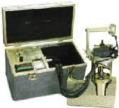
Fig. 3: Portable case with recording unit, testing device, core sleeve, and concrete sample

Today, the Swedish friction grip is only a Swedish standard (SS 13 72 43). It's common practice for in-place testing of both shotcrete applied on rock and old concrete. The upcoming European standard for testing of bond strength does not deal with the