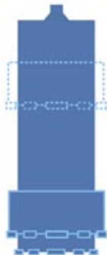
Fig. 1: Schematic sketch of drill with double bits (outer bit movable along the inner drill bit)

In the early 1970s, Vattenfall AB (formerly the Swedish State Power Board), the Swedish electrical power producer, developed a method to make it possible to perform in-place testing of bond strength without using glue. The so-called “friction grip” was developed to make this possible. Drilling is performed using a drill with double bits. Only the inner drill bit (inner/outer diameter = 2.8/3.4 in. [72/86 mm]) is drilling through the shotcrete and into the underlying substrate. The outer drill bit (inner/outer diameter = 4.1/4.4 in. [104/111 mm]) is only used to make a guidance