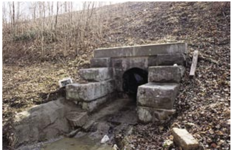
Fig. 3: Exterior view of aqueduct crossing stream culvert