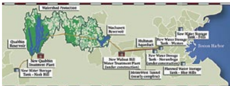
Fig. 1: MWRA integrated water system

The restoration project primarily consisted of applying a 3 in.-thick wire-reinforced wet-mix shotcrete lining to the entire surface of the 7 mi underground horseshoe-shaped concrete and brick portion of the aqueduct, incorporating over 15,000 yd 3