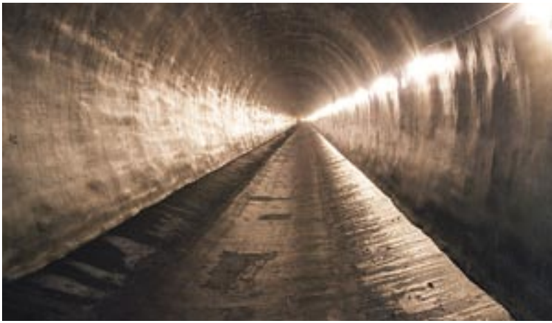
Fig. 5: Finished tunnel

stiffness to ensure the mesh did not deflect from the impact of shotcrete placement. To ensure thickness and finish tolerances, guide wires and thickness pins were used throughout the entire 7 mi of tunnel, invert, walls, and crown.