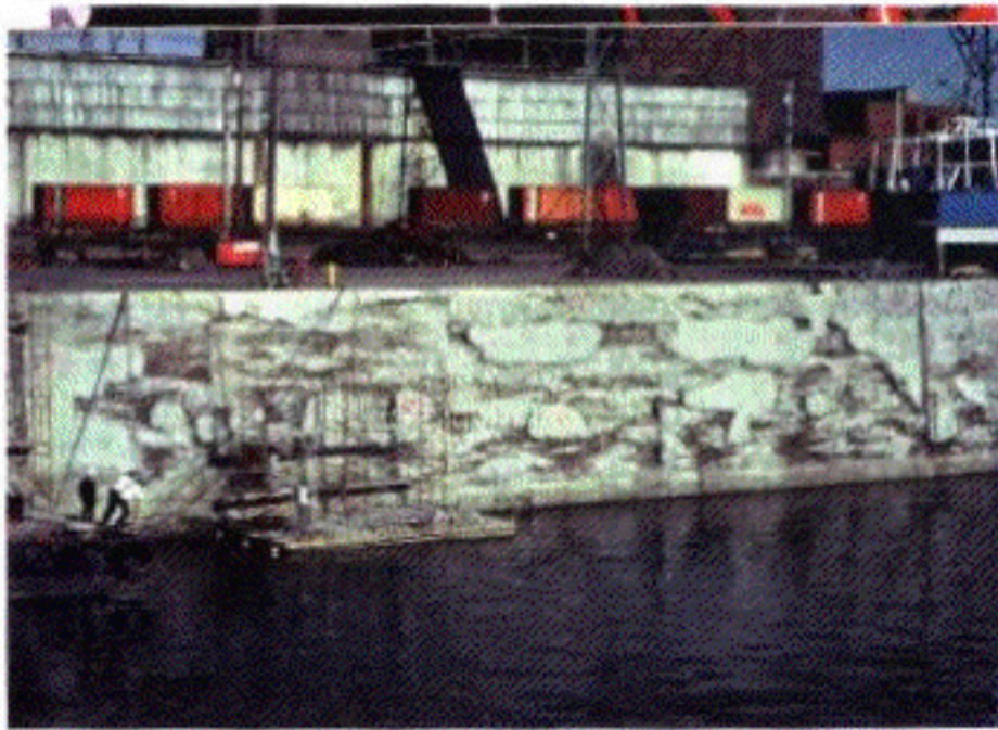
Figure 5: Preparation of shipping berth faces at Port of