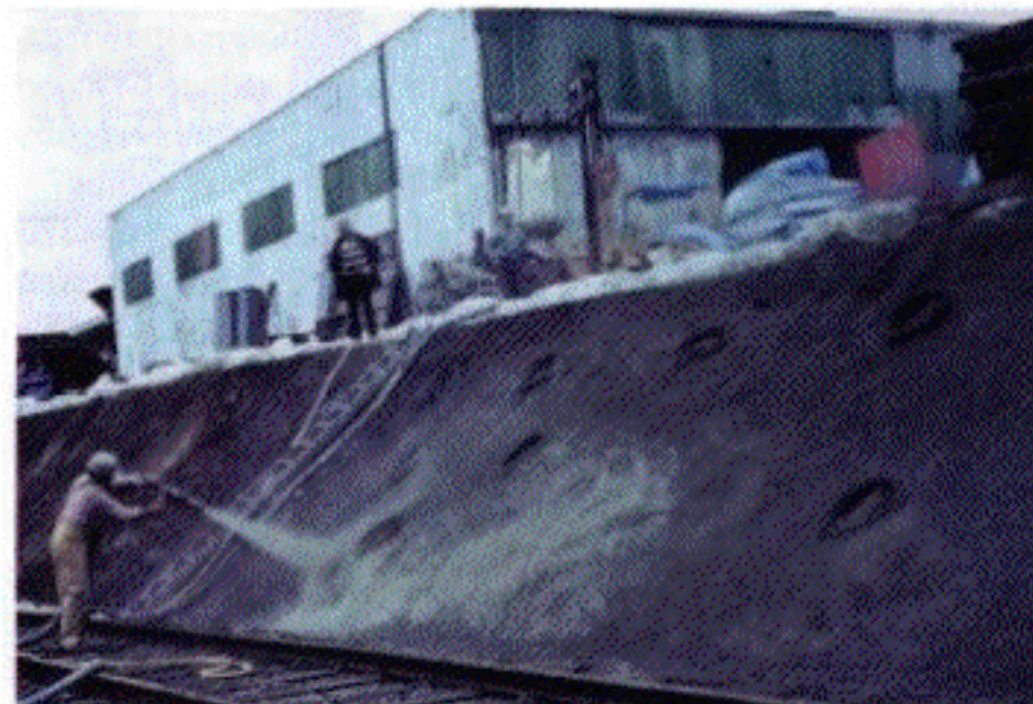
Figure 2. Railway embankment stabilization with SFRS, Burnaby, British Columbia, 1977.