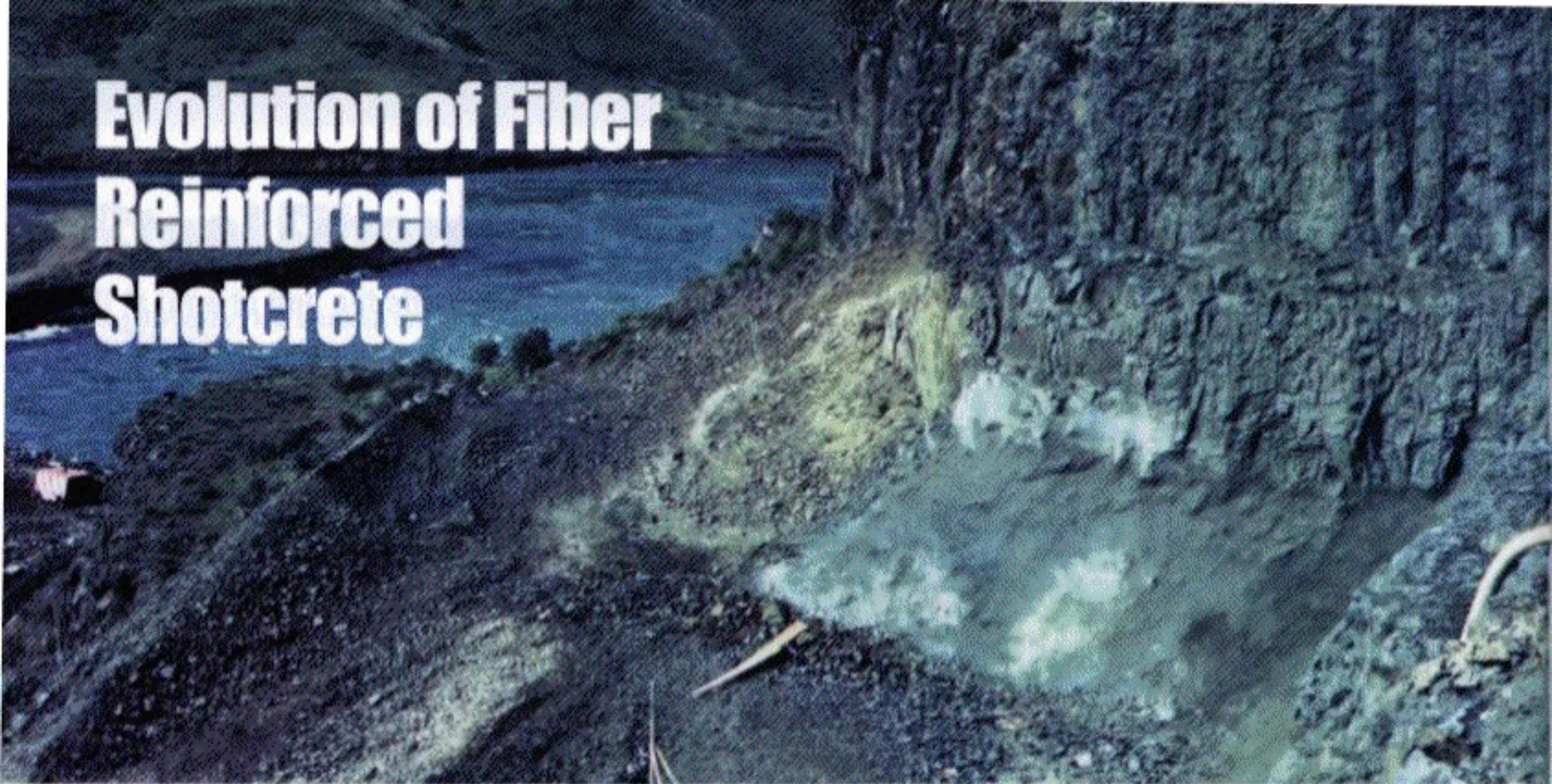
Figure 1. Rock slope stabilization with SFRS, Snake River, Idaho, 1972.

Prior to the 1970's, shotcrete was typically reinforced with welded wire mesh fabric or conventional reinforcing steel. Chicken wire was sometimes used in some applications (e.g., artificial rockscape construction), and chain-link mesh was used in some mining applications where large deformations were expected and the cracked reinforced shotcrete had to continue to carry load.