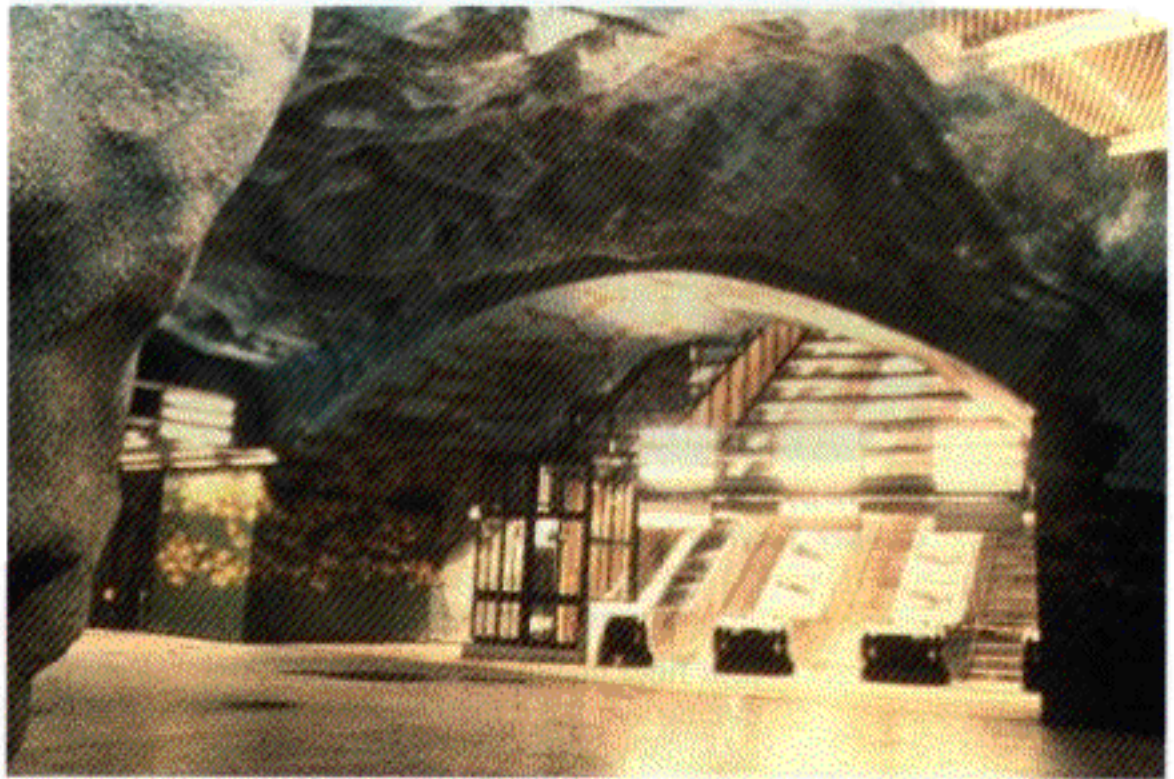
Figure 4. SFRS final tunnel lining of underground metro (passenger railway station) in Stockholm, Sweden.

for much higher addition rates to shotcrete than the earlier generation collated fibrillated fibers mainly because of their lower surface area. Some fiber types were able to be shot at fiber addition rates as high as 20 kg/m 3 (34 lb/yd 3 ), but most practical applications were for fibers at addition rates of between 7 to 13 kg/m 3 (12 to 22 lb/yd 3 ), with 9 kg/m 3 (15 lb/yd 3 ) or 1.0% volume of fiber being a fairly common addition rate for some of the better performing fiber types. Most of the new generation synthetic fibers are either monofilament type fibers, or bundled assemblies of fine fibers with a monofilament appearance. Some of the fiber types have a slight fibrillating characteristic on mixing and shooting. Currently,