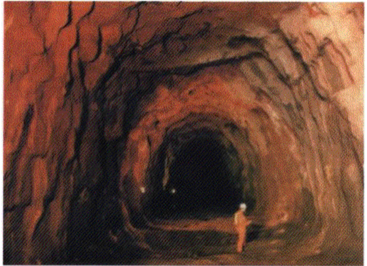
Figure 3. SFRS final tunnel lining, Stave Falls Hydro Electric Project, British Columbia, 1998.

In the mid-1990's, new generations of synthetic fibers were developed. These fibers were suitable